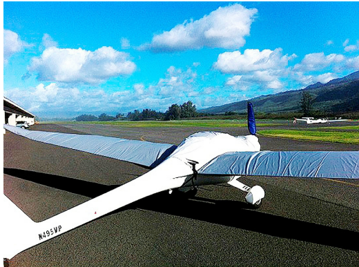
Lambda Canopy/Engine Cover and Wing Covers

WINTER USE MATERIAL - Made with Solution-Dyed Polyester fabric, this option is intended for seasonal use to aid in deicing, rain mitigation, or for occasional travel. The material is lighter and more compact, but more susceptible to UV damage and may have a shorter useful life if used continuously outside than the all-year use material.