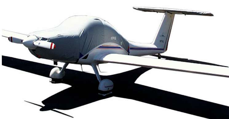
Grob 109 Canopy/Engine Cover & Horiz. Stabilizer Cover

WINTER USE MATERIAL - Made with Solution-Dyed Polyester fabric, this option is intended for seasonal use to aid in deicing, rain mitigation, or for occasional travel. The material is lighter and more compact, but more susceptible to UV damage and may have a shorter useful life if used continuously outside than the all-year use material.