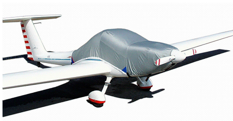
Grob 109 Canopy/Engine Cover