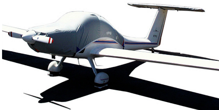
Grob 109 Canopy/Engine Cover & Horiz. Stabilizer Cover