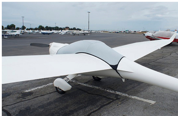
Lambada Canopy/Engine Cover and Wing Covers