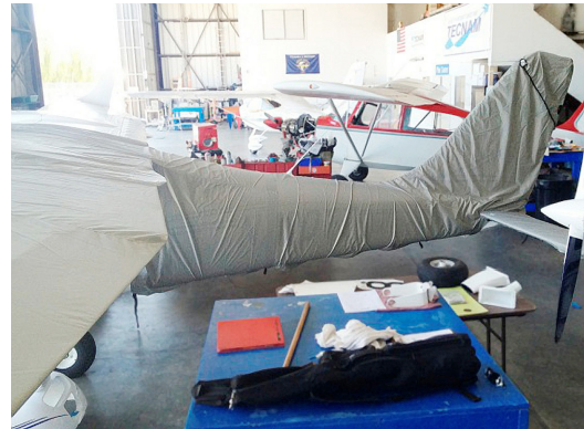
Tecnam Twin Wing & Empennage Covers