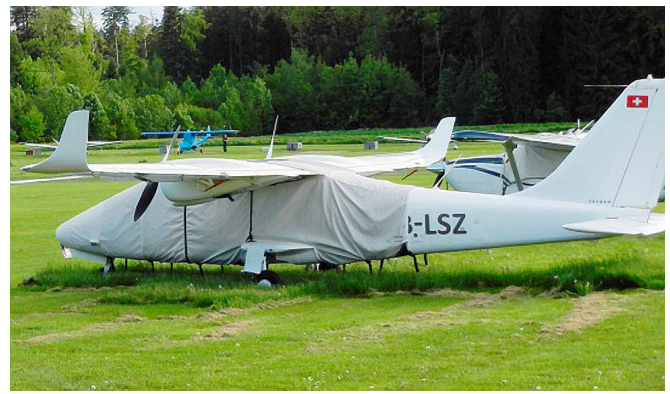
Tecnam Twin Extended Canopy/Nose Cover