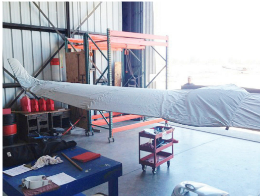
Tecnam Twin Wing/Engine Covers

WINTER USE MATERIAL - Made with Solution-Dyed Polyester fabric, this option is intended for seasonal use to aid in deicing, rain mitigation, or for occasional travel. The material is lighter and more compact, but more susceptible to UV damage and may have a shorter useful life if used continuously outside than the all-year use material.