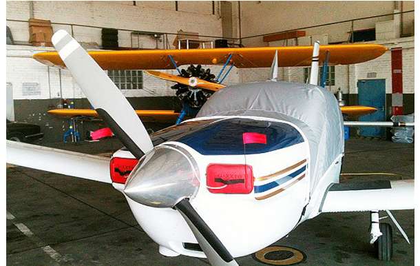
Socata TB20 Canopy Cover and Engine Inlet Plugs