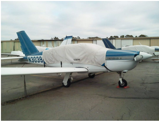
Socata TB-20 Trinidad Canopy Cover

This cover type is made from Silver Acrylic Sunbrella canvas and is 100% lined with a soft and smooth microfiber. Bruce's Custom Covers developed this material combination especially for aircraft protection. The outer material is medium weight and treated for water resistance, UV resistance and anti-static buildup. The inner lining is a very soft and smooth microfiber to prevent scratching. The material is very reflective, and tests show that the cabin interior temperature can be reduced to near-ambient temperature on the hottest of days. It is water, ice and snow repellent, yet breathable to allow moisture to escape from between the cover and the aircraft surface.