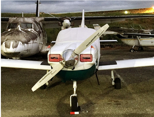
Socata TB9 Tampico Canopy Cover and Engine Inlet Plugs

Engine Inlet Plugs are custom fit for your Socata Tampico, Tobago & Trinidad intakes, made with heavy-duty vinyl material, and stuffed with a single block of sculpted urethane foam. Each plug has a zipper that allows the foam to be removed and dried if necessary. Engine plugs have warning flags that are visible from the cockpit or 'remove before flight' streamers sewn onto the face of the plugs. Most plugs are imprinted with the aircraft registration number in black for an extra charge. Storage bag NOT included. Engine plugs may be inserted after flight when the engine is still warm. Engine Inlet Plugs are commonly referred to as Cowl Plugs, Intake Plugs, Cowl Blocks, Engine Blocks, and Engine Bungs.