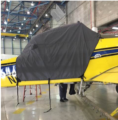
Air Tractor AT-802F Canopy Cover

Travel Covers are made with Silver Solution-Dyed Polyester fabric and only lined over the windshield to save weight. The material is lightweight and more compact for easy stowage in the aircraft. The polyester material is water resistant, but only intended for occasional use outside. We also have an ultra lightweight material available for fitted hangar dust covers. For daily outdoor use, the non-travel Sunbrella Cover is the best choice.