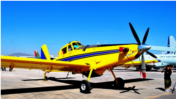
Air Tractor Prop Tie/Exhaust Covers