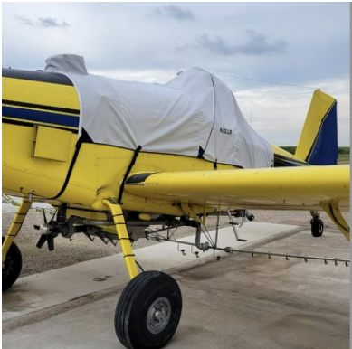
Air Tractor Inc AT-802A Canopy/Hopper Cover

This cover type is made from Silver Acrylic Sunbrella canvas and is 100% lined with a soft and smooth microfiber. Bruce's Custom Covers developed this material combination especially for aircraft protection. The outer material is medium weight and treated for water resistance, UV resistance and anti-static buildup. The inner lining is a very soft and smooth microfiber to prevent scratching. The material is very reflective, and tests show that the cabin interior temperature can be reduced to near-ambient temperature on the hottest of days. It is water, ice and snow repellent, yet breathable to allow moisture to escape from between the cover and the aircraft surface.