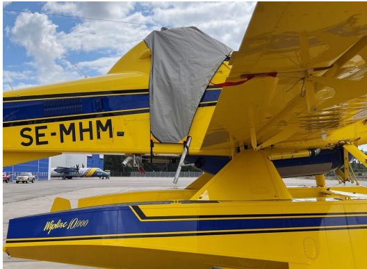
Air Tractor Light Weight Canopy Cover