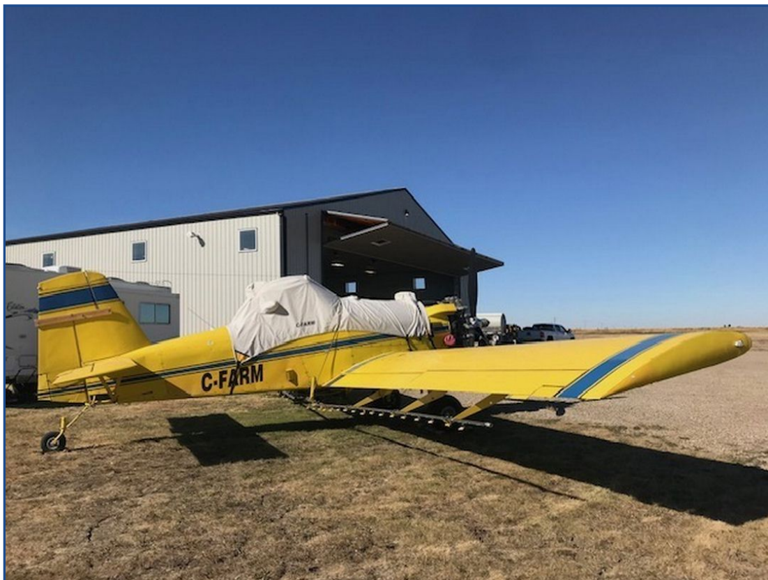
Air Tractor 401 Canopy/Hopper Cover