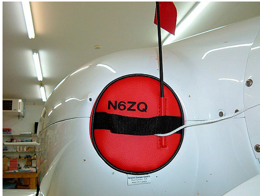
Lancair 320 Engine Inlet Plugs

Engine Inlet Plugs are custom fit for your TL Ultralight Stream intakes, made with heavy-duty vinyl material, and stuffed with a single block of sculpted urethane foam. Each plug has a zipper that allows the foam to be removed and dried if necessary. Engine plugs have warning flags that are visible from the cockpit or 'remove before flight' streamers sewn onto the face of the plugs. Most plugs are imprinted with the aircraft registration number in black for an extra charge. Storage bag NOT included. Engine plugs may be inserted after flight when the engine is still warm. Engine Inlet Plugs are commonly referred to as Cowl Plugs, Intake Plugs, Cowl Blocks, Engine Blocks, and Engine Bungs.