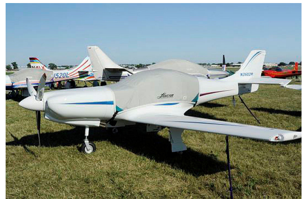
Lancair 360 MkII Canopy Cover