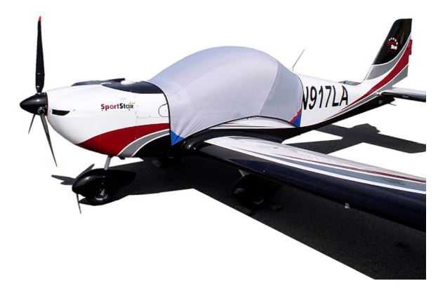
TL Ultralight TL 2000 Sting Sport, 96 Star, S3, S4 Canopy Cover