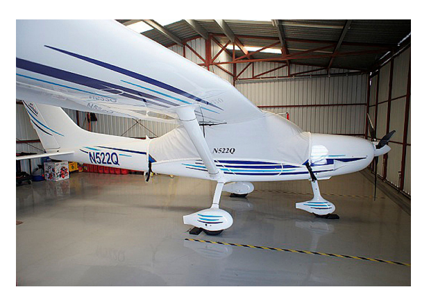
TL Ultralight Sirius Canopy Cover