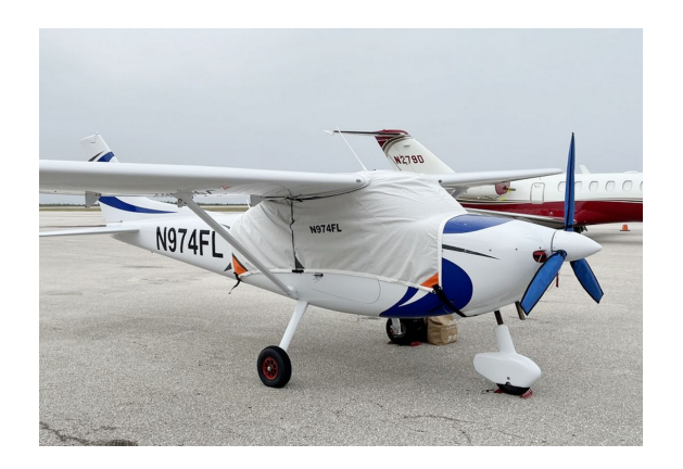
Orlican Eagle M-8 Canopy Cover

This cover type is made from Silver Acrylic Sunbrella canvas and is 100% lined with a soft and smooth microfiber. Bruce's Custom Covers developed this material combination especially for aircraft protection. The outer material is medium weight and treated for water resistance, UV resistance and anti-static buildup. The inner lining is a very soft and smooth microfiber to prevent scratching. The material is very reflective, and tests show that the cabin interior temperature can be reduced to near-ambient temperature on the hottest of days. It is water, ice and snow repellent, yet breathable to allow moisture to escape from between the cover and the aircraft surface.