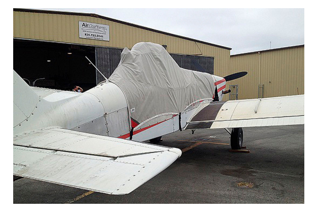
Piper Brave PA-36 Canopy/Hopper Cover

This cover type is made from Silver Acrylic Sunbrella canvas and is 100% lined with a soft and smooth microfiber. Bruce's Custom Covers developed this material combination especially for aircraft protection. The outer material is medium weight and treated for water resistance, UV resistance and anti-static buildup. The inner lining is a very soft and smooth microfiber to prevent scratching. The material is very reflective, and tests show that the cabin interior temperature can be reduced to near-ambient temperature on the hottest of days. It is water, ice and snow repellent, yet breathable to allow moisture to escape from between the cover and the aircraft surface.