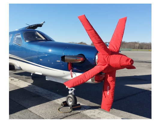
Socata TBM Insulated 5-Blade Prop/Spinner Cover

This cover type is made from Silver Acrylic Sunbrella canvas and is 100% lined with a soft and smooth microfiber. Bruce's Custom Covers developed this material combination especially for aircraft protection. The outer material is medium weight and treated for water resistance, UV resistance and anti-static buildup. The inner lining is a very soft and smooth microfiber to prevent scratching. The material is very reflective, and tests show that the cabin interior temperature can be reduced to near-ambient temperature on the hottest of days. It is water, ice and snow repellent, yet breathable to allow moisture to escape from between the cover and the aircraft surface.