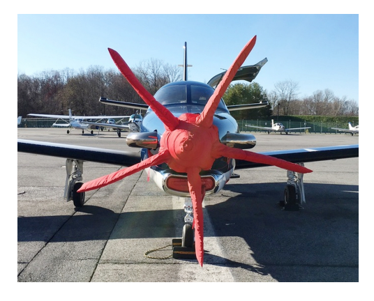
Socata TBM Insulated 5-Blade Prop/Spinner Cover