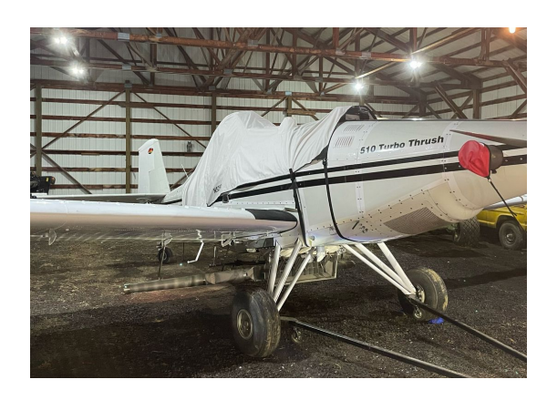
Thrush Aircraft S2R-T34 Canopy Cover, & Prop Tie/Exhaust Covers