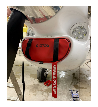
Thrush Intake Plug (Cascade Conversion)