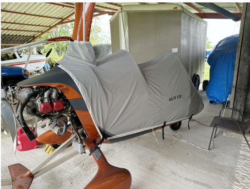
MTO Sport Travel Weight Canopy/Nose Cover