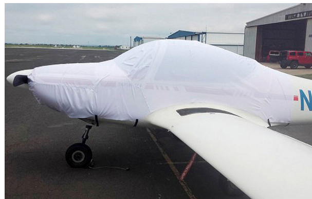
Taifun 17E Canopy/Engine Cover, test fit cover