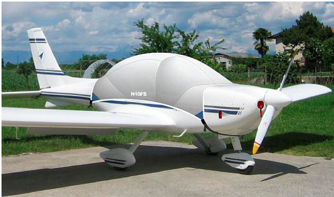
Texan Canopy Cover & Engine Plugs (Illustration)

This cover type is made from Silver Acrylic Sunbrella canvas and is 100% lined with a soft and smooth microfiber. Bruce's Custom Covers developed this material combination especially for aircraft protection. The outer material is medium weight and treated for water resistance, UV resistance and anti-static buildup. The inner lining is a very soft and smooth microfiber to prevent scratching. The material is very reflective, and tests show that the cabin interior temperature can be reduced to near-ambient temperature on the hottest of days. It is water, ice and snow repellent, yet breathable to allow moisture to escape from between the cover and the aircraft surface.