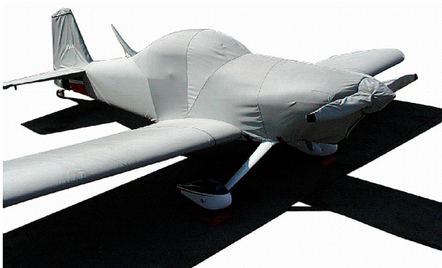
Van's RV-4 Complete Cover