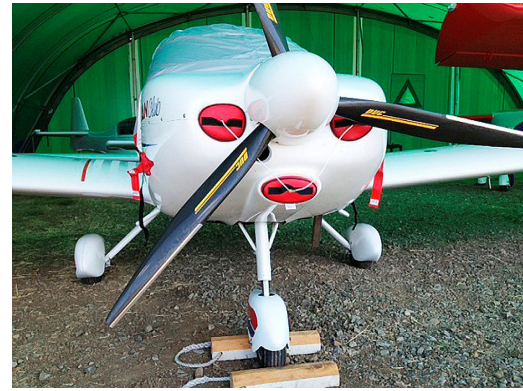
Texan Club Sport 550 Lightweight Travel Cover and Engine Inlet Plugs set