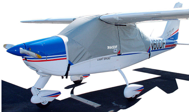
Tecnam Bravo Canopy Cover

The material is very reflective, and tests show that the cabin interior temperature can be reduced to near-ambient temperature on the hottest of days. It is water, ice and snow repellent, yet breathable to allow moisture to escape from between the cover and the aircraft surface.