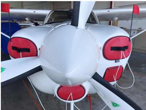
Tecnam Engine Plugs, set of 5