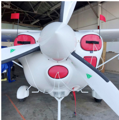
Tecnam Engine Plugs, set of 5

Engine Inlet Plugs are custom fit for your Tecnam P92 Eaglet intakes, made with heavy-duty vinyl material, and stuffed with a single block of sculpted urethane foam. Each plug has a zipper that allows the foam to be removed and dried if necessary. Engine plugs have warning flags that are visible from the cockpit or 'remove before flight' streamers sewn onto the face of the plugs. Most plugs are imprinted with the aircraft registration number in black for an extra charge. Storage bag NOT included. Engine plugs may be inserted after flight when the engine is still warm. Engine Inlet Plugs are commonly referred to as Cowl Plugs, Intake Plugs, Cowl Blocks, Engine Blocks, and Engine Bungs.