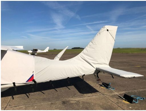
Tecnam P2008 Empennage Cover (Tailboom, Vertical & Horiz Stabilizers), All Year Use