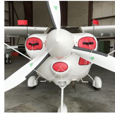
Tecnam P2010 Engine Plugs