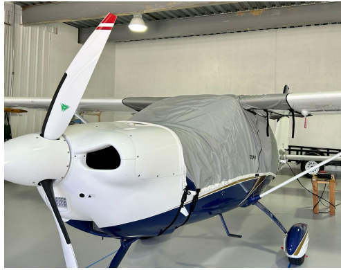
Tecnam P2010 Lightweight Travel Canopy Cover

occasional use outside. We also have an ultra lightweight material available for fitted hangar dust covers. For daily outdoor use, the non-travel Sunbrella Cover is the best choice.