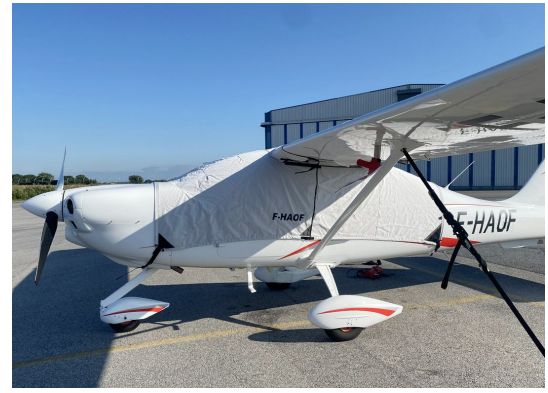
Tecnam P2010 Over-Top Canopy Cover