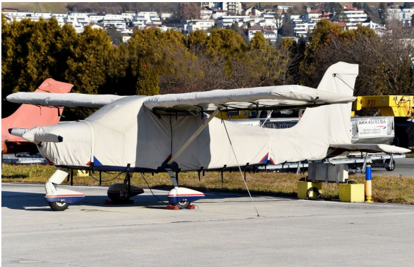
Tecnam P92 Echo Complete Cover Set