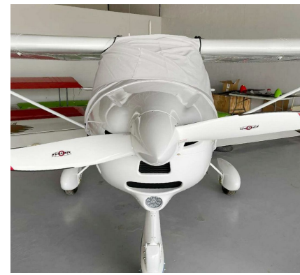
Tecnam P92 Echo Super Canopy Cover, Wrap-Around