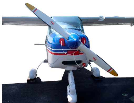
Tecnam Bravo Engine Plugs