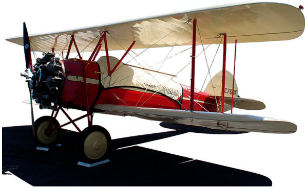
Waco 10 Canopy Cover