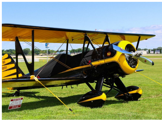
Curtiss Wright Travel Air B-14-R Canopy Cover