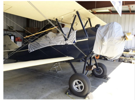
Travelair 4000 Canopy & Engine Covers, light weight travel type