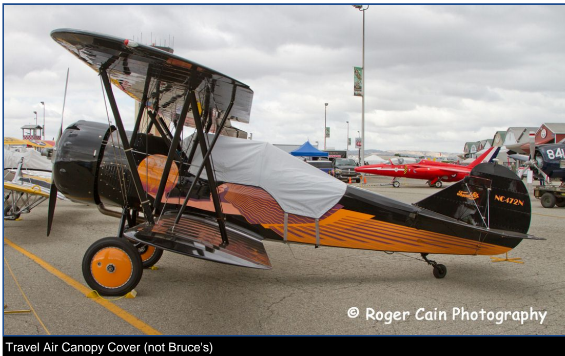
Travel Air Canopy Cover (not Bruce's)