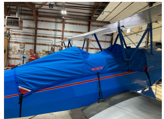
Travel Air 4000 Canopy Cover