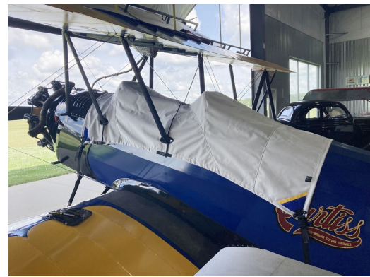
KELCH TA-12 Travel Air Canopy Cover