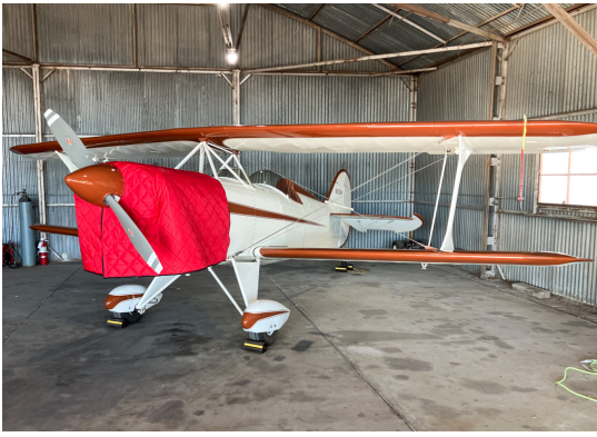
SKYBOLT, Insulated Hangar Blanket, Custom Fit Interior Use)