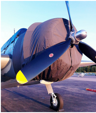
TBM Avenger Engine Cover