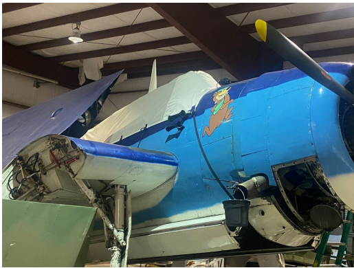
Grumman TBF & TBM Avenger Canopy Cover