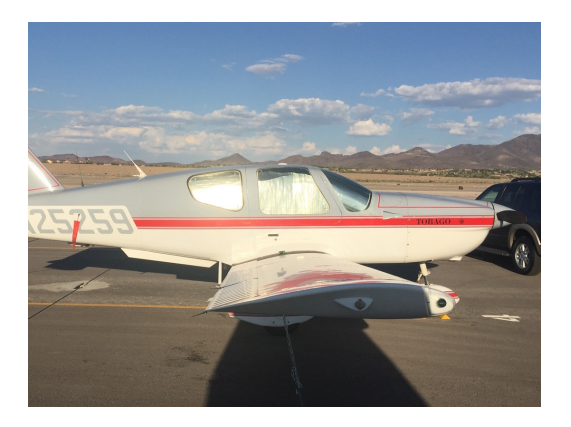
Socata TB-10 Cabin HeatShields