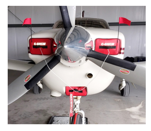
Socata TB-20 Engine Plugs, set of 3

Cowl Blocks, Engine Blocks, and Engine Bungs.