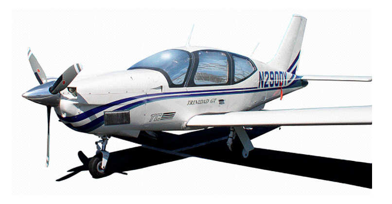
Socata TB20 HeatShields

Windshield Heatshields are interior sunshades for an aircraft's front windshield. The product is a unique composite of closed-cell foam with a silver mylar finish. The semi-rigid design is stiff enough to stand along the inside of the windshield using sun visors or window framing. It folds up flat and easily stores in the included storage sleeve. Some designs may require velcro and suction cups or split right and left sides. A Heatshield is an excellent short-term remedy for cockpit overheating. An external fabric cover is far more effective and practical for long-term protection.