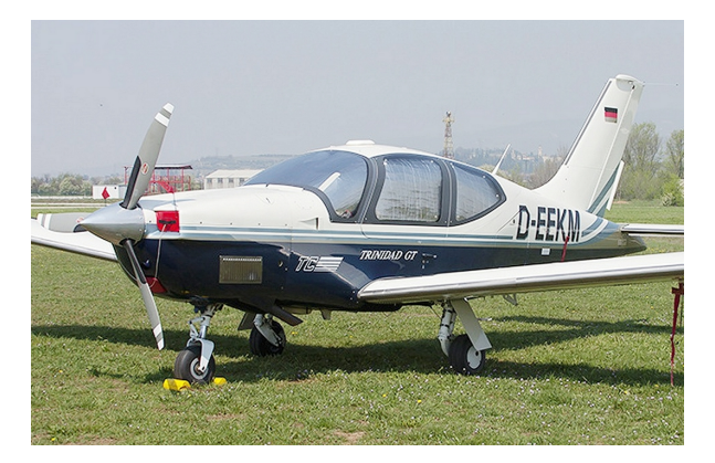
TB-9 Engine Plugs and HeatShields