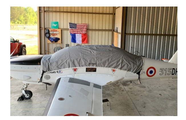
Socata TB-30 Travel Weight Canopy Cover

Travel Covers are made with Silver Solution-Dyed Polyester fabric and only lined over the windshield to save weight. The material is lightweight and more compact for easy stowage in the aircraft. The polyester material is water resistant, but only intended for occasional use outside. We also have an ultra lightweight material available for fitted hangar dust covers. For daily outdoor use, the non-travel Sunbrella Cover is the best choice.