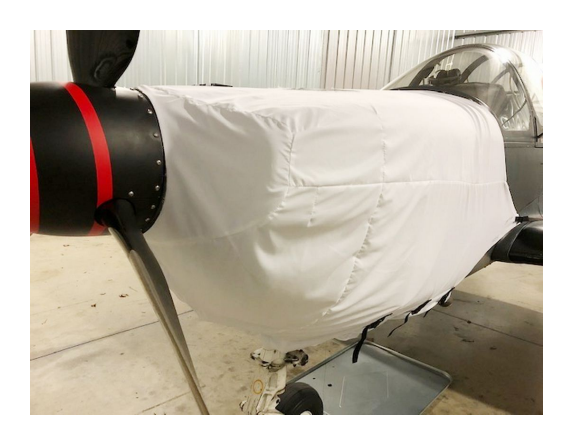
Socata Epsilon TB-30 Insulated Engine Cover, test fit cover