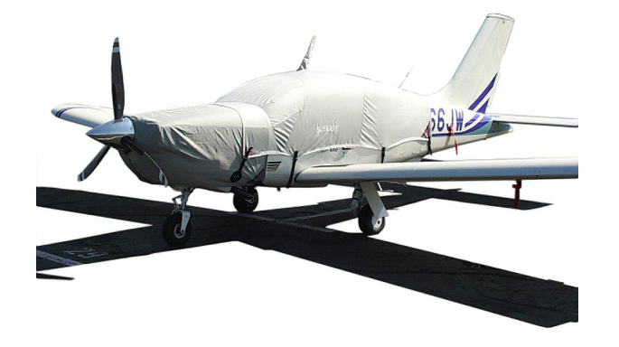
Canopy Cover & Engine Cover

This cover type is made from Silver Acrylic Sunbrella canvas and is 100% lined with a soft and smooth microfiber. Bruce's Custom Covers developed this material combination especially for aircraft protection. The outer material is medium weight and treated for water resistance, UV resistance and anti-static buildup. The inner lining is a very soft and smooth microfiber to prevent scratching. The material is very reflective, and tests show that the cabin interior temperature can be reduced to near-ambient temperature on the hottest of days. It is water, ice and snow repellent, yet breathable to allow moisture to escape from between the cover and the aircraft surface.