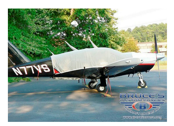
Socata TB20 Canopy Cover