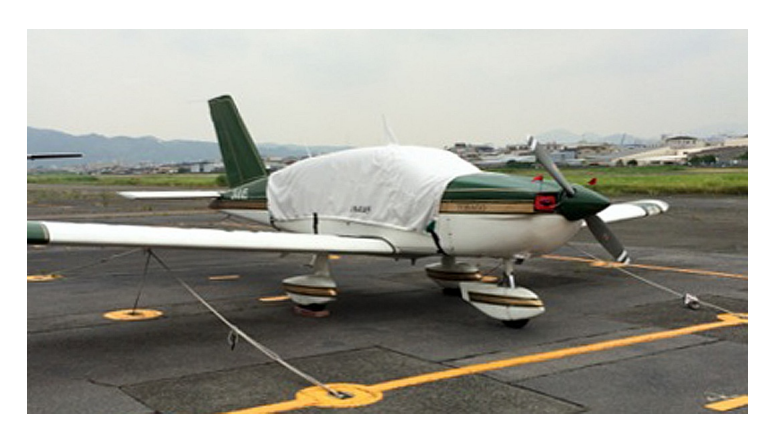
Canopy Cover & Engine Cover