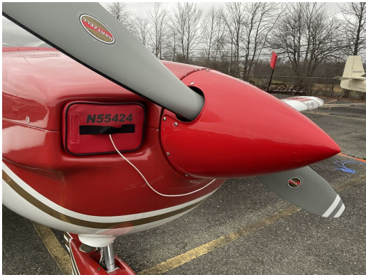
Socata Tobago Engine Plugs