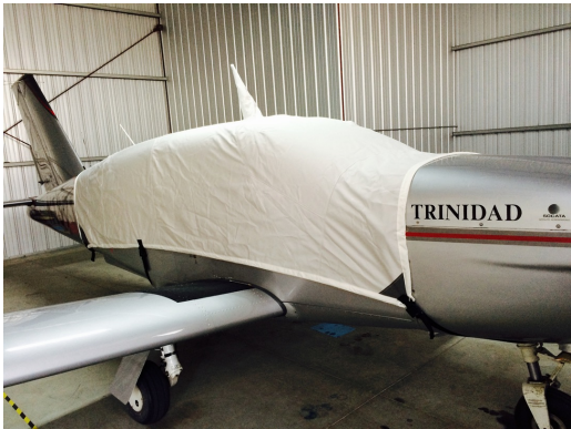
Trinidad Canopy Cover

This cover type is made from Silver Acrylic Sunbrella canvas and is 100% lined with a soft and smooth microfiber. Bruce's Custom Covers developed this material combination especially for aircraft protection. The outer material is medium weight and treated for water resistance, UV resistance and anti-static buildup. The inner lining is a very soft and smooth microfiber to prevent scratching. The material is very reflective, and tests show that the cabin interior temperature can be reduced to near-ambient temperature on the hottest of days. It is water, ice and snow repellent, yet breathable to allow moisture to escape from between the cover and the aircraft surface.