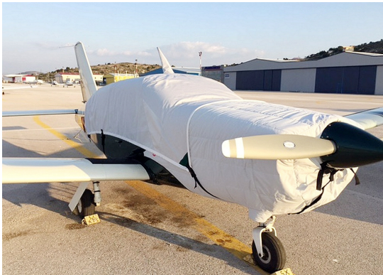
Socata TB-20 Canopy Cover, Insulated Engine Cover