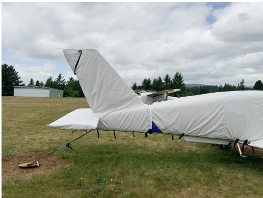
Socata Tampico TB-9C Cover Set