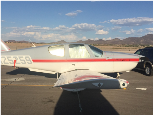
Socata TB-10 Cabin HeatShields