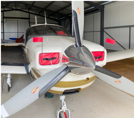
Trinidad: TB20-GT Engine Inlet Plugs

Engine Inlet Plugs are custom fit for your Socata TB9-GT, Tobago: TB10-GT & TB200-GT, Trinidad: TB20-GT, TB21-GT intakes, made with heavy-duty vinyl material, and stuffed with a single block of sculpted urethane foam. Each plug has a zipper that allows the foam to be removed and dried if necessary. Engine plugs have warning flags that are visible from the cockpit or 'remove before flight' streamers sewn onto the face of the plugs. Most plugs are imprinted with the aircraft registration number in black for an extra charge. Storage bag NOT included. Engine plugs may be inserted after flight when the engine is still warm. Engine Inlet Plugs are commonly referred to as Cowl Plugs, Intake Plugs, Cowl Blocks, Engine Blocks, and Engine Bungs.