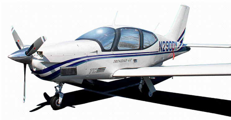
Socata TB20 HeatShields

Windshield Heatshields are interior sunshades for an aircraft's front windshield. The product is a unique composite of closed-cell foam with a silver mylar finish. The semi-rigid design is stiff enough to stand along the inside of the windshield using sun visors or window framing. It folds up flat and easily stores in the included storage sleeve. Some designs may require velcro and suction cups or split right and left sides. A Heatshield is an excellent short-term remedy for cockpit overheating. An external fabric cover is far more effective and practical for long-term protection.