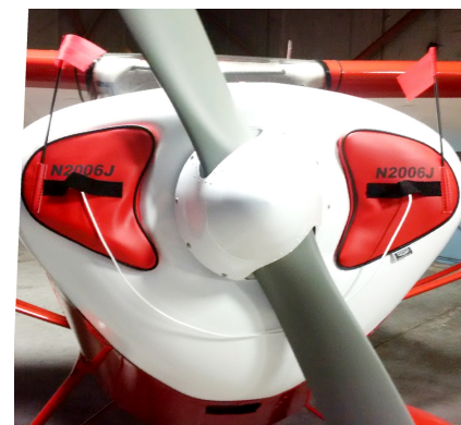
ENGINE PLUGS PREVENT BIRD NEST FOD. Piper Saratoga Engine Cowling Bird's Nest Taylorcraft Engine Inlet Plugs