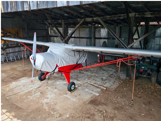
Taylorcraft BC12-D Canopy Cover, Over Top Type