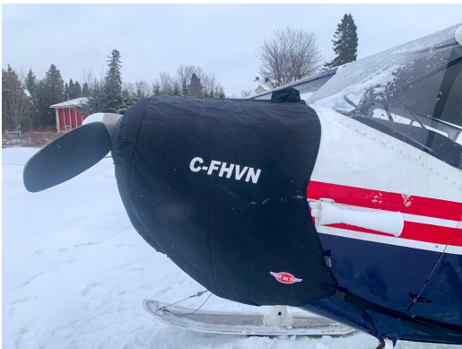
Taylorcraft Models B & F Insulated Engine Cover