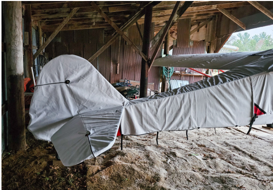
Taylorcraft BC12-D Empennage Cover (Taillboom, Vertical & Horiz Stabilizers) All Year Use

WINTER USE MATERIAL - Made with Solution-Dyed Polyester fabric, this option is intended for seasonal use to aid in deicing, rain mitigation, or for occasional travel. The material is lighter and more compact, but more susceptible to UV damage and may have a shorter useful life if used continuously outside than the all-year use material.