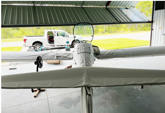
Pipistrel Taurus Complete Cover Set