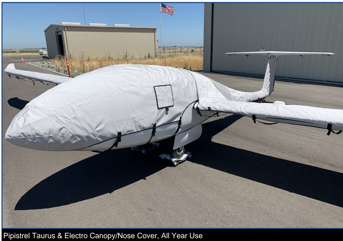
Pipistrel Taurus &amp; Electro Canopy/Nose Cover, All Year Use