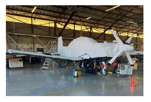
Beech T-6A Texan 2 Complete Hail Protection Cover Set