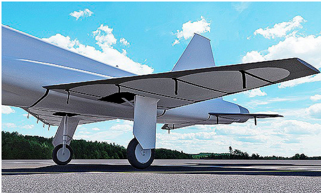
T-38 Talon Wing and Horizontal Stabilizer Covers (3D Rendering)