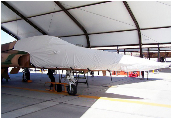
Northup F-5 Talon Canopy/Nose Cover

This cover type is made from Silver Acrylic Sunbrella canvas and is 100% lined with a soft and smooth microfiber. Bruce's Custom Covers developed this material combination especially for aircraft protection. The outer material is medium weight and treated for water resistance, UV resistance and anti-static buildup. The inner lining is a very soft and smooth microfiber to prevent scratching. The material is very reflective, and tests show that the cabin interior temperature can be reduced to near-ambient temperature on the hottest of days. It is water, ice and snow repellent, yet breathable to allow moisture to escape from between the cover and the aircraft surface.