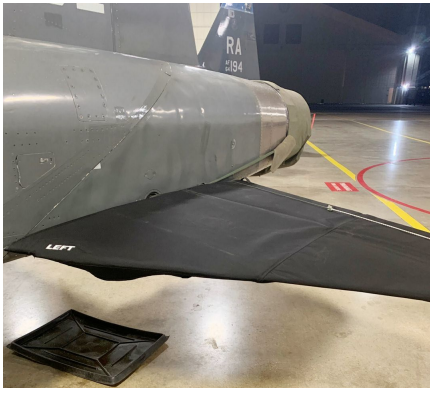
Northrop T-38 Horizontal Stabilizer Cover