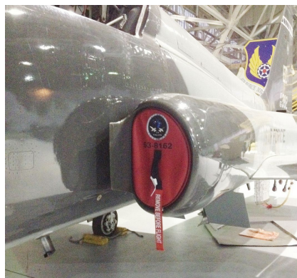
Northrup Grumman T38-C Intake Plugs

The Engine Inlet Plugs are custom fit for your Northrop Talon T-38 Trainer intakes, made with heavy-duty vinyl material, and stuffed with a single block of sculpted urethane foam. Each plug has a zipper that allows the foam to be removed and dried if necessary. Engine plugs have 'remove before flight' streamers sewn onto the face of the plugs. Most plugs are imprinted with the aircraft registration number in black for an extra charge. Storage bag NOT included. Engine plugs may be inserted after flight when the engine is still warm. Engine Inlet Plugs are commonly referred to as Cowl Plugs, Intake Plugs, Cowl Blocks, Engine Blocks, and Engine Bungs.