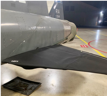
Northrop T-38 Horizontal Stabilizer Cover

WINTER USE MATERIAL - Made with Solution-Dyed Polyester fabric, this option is intended for seasonal use to aid in deicing, rain mitigation, or for occasional travel. The material is lighter and more compact, but more susceptible to UV damage and may have a shorter useful life if used continuously outside than the all-year use material.