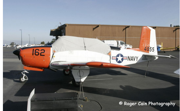
Beech T-34 Canopy Cover