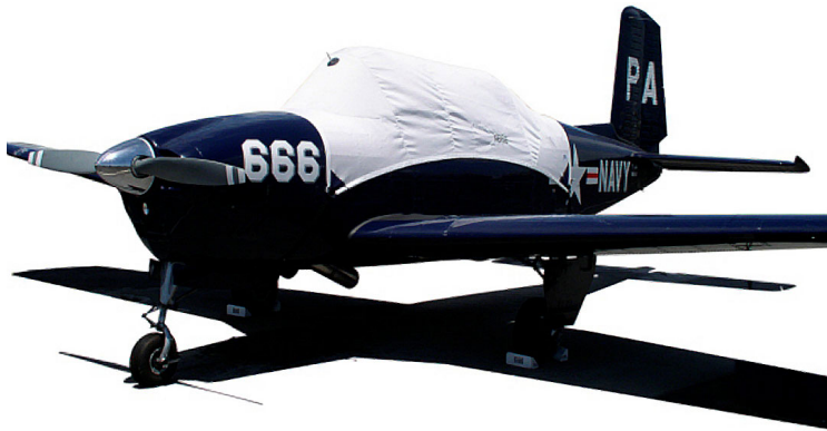
The T34 Canopy Cover

Travel Covers are made with Silver Solution-Dyed Polyester fabric and only lined over the windshield to save weight. The material is lightweight and more compact for easy stowage in the aircraft. The polyester material is water resistant, but only intended for occasional use outside. We also have an ultra lightweight material available for fitted hangar dust covers. For daily outdoor use, the non-travel Sunbrella Cover is the best choice.