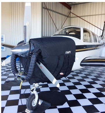
Beech Bonanza 36 Models Insulated Engine Cover

This cover type is made from Silver Acrylic Sunbrella canvas and is 100% lined with a soft and smooth microfiber. Bruce's Custom Covers developed this material combination especially for aircraft protection. The outer material is medium weight and treated for water resistance, UV resistance and anti-static buildup. The inner lining is a very soft and smooth microfiber to prevent scratching. The material is very reflective, and tests show that the cabin interior temperature can be reduced to near-ambient temperature on the hottest of days. It is water, ice and snow repellent, yet breathable to allow moisture to escape from between the cover and the aircraft surface.