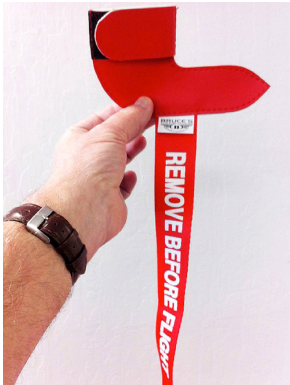
Standard Pitot Cover

Engine Inlet Plugs are custom fit for your Beech T34 Mentor (T-34, T-34C) intakes, made with heavy-duty vinyl material, and stuffed with a single block of sculpted urethane foam. Each plug has a zipper that allows the foam to be removed and dried if necessary. Engine plugs have warning flags that are visible from the cockpit or 'remove before flight' streamers sewn onto the face of the plugs. Most plugs are imprinted with the aircraft registration number in black for an extra charge. Storage bag NOT included. Engine plugs may be inserted after flight when the engine is still warm. Engine Inlet Plugs are commonly referred to as Cowl Plugs, Intake Plugs, Cowl Blocks, Engine Blocks, and Engine Bungs.