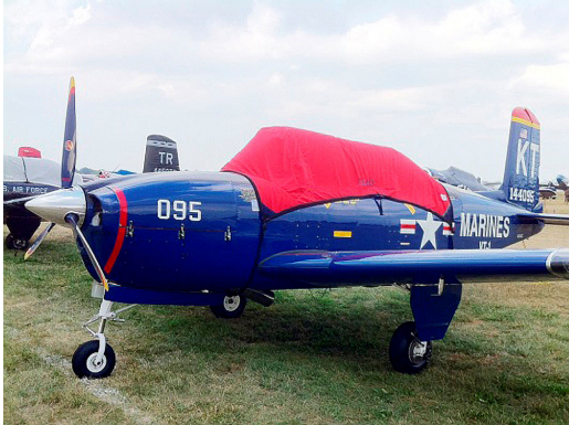
The T34 Canopy Cover

This cover type is made from Silver Acrylic Sunbrella canvas and is 100% lined with a soft and smooth microfiber. Bruce's Custom Covers developed this material combination especially for aircraft protection. The outer material is medium weight and treated for water resistance, UV resistance and anti-static buildup. The inner lining is a very soft and smooth microfiber to prevent scratching. The material is very reflective, and tests show that the cabin interior temperature can be reduced to near-ambient temperature on the hottest of days. It is water, ice and snow repellent, yet breathable to allow moisture to escape from between the cover and the aircraft surface.