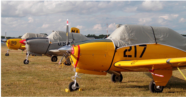
T34 Canopy Covers & Engine Inlet Plugs

of the plugs. Most plugs are imprinted with the aircraft registration number in black for an extra charge. Storage bag NOT included. Engine plugs may be inserted after flight when the engine is still warm. Engine Inlet Plugs are commonly referred to as Cowl Plugs, Intake Plugs, Cowl Blocks, Engine Blocks, and Engine Bungs.