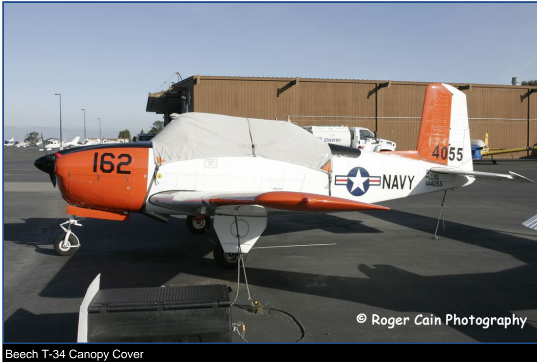
Beech T-34 Canopy Cover