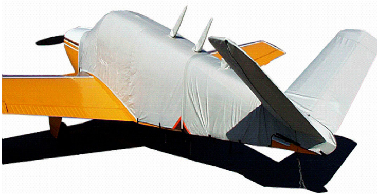
Extended Canopy Cover & Empennage Cover

WINTER USE MATERIAL - Made with Solution-Dyed Polyester fabric, this option is intended for seasonal use to aid in deicing, rain mitigation, or for occasional travel. The material is lighter and more compact, but more susceptible to UV damage and may have a shorter useful life if used continuously outside than the all-year use material.