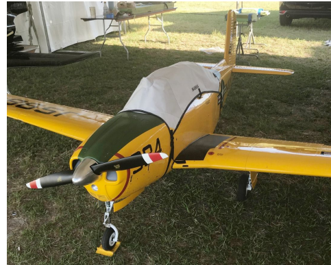
Beechcraft T-34B Mentor Canopy Cover, for 36% Scale Model