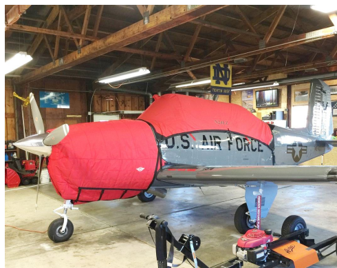
Beech T34 Mentor Canopy Cover, Insulated Engine Cover