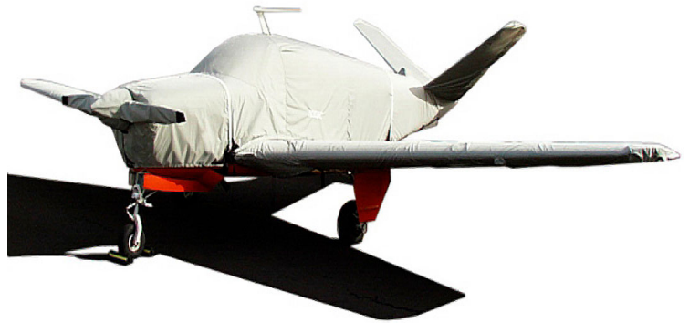
Beech Bonanza Full Cover Set