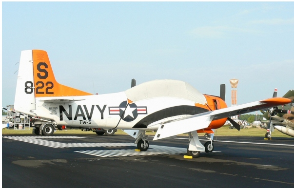
North American T-28 Canopy Cover

This cover type is made from Silver Acrylic Sunbrella canvas and is 100% lined with a soft and smooth microfiber. Bruce's Custom Covers developed this material combination especially for aircraft protection. The outer material is medium weight and treated for water resistance, UV resistance and anti-static buildup. The inner lining is a very soft and smooth microfiber to prevent scratching. The material is very reflective, and tests show that the cabin interior temperature can be reduced to near-ambient temperature on the hottest of days. It is water, ice and snow repellent, yet breathable to allow moisture to escape from between the cover and the aircraft surface.