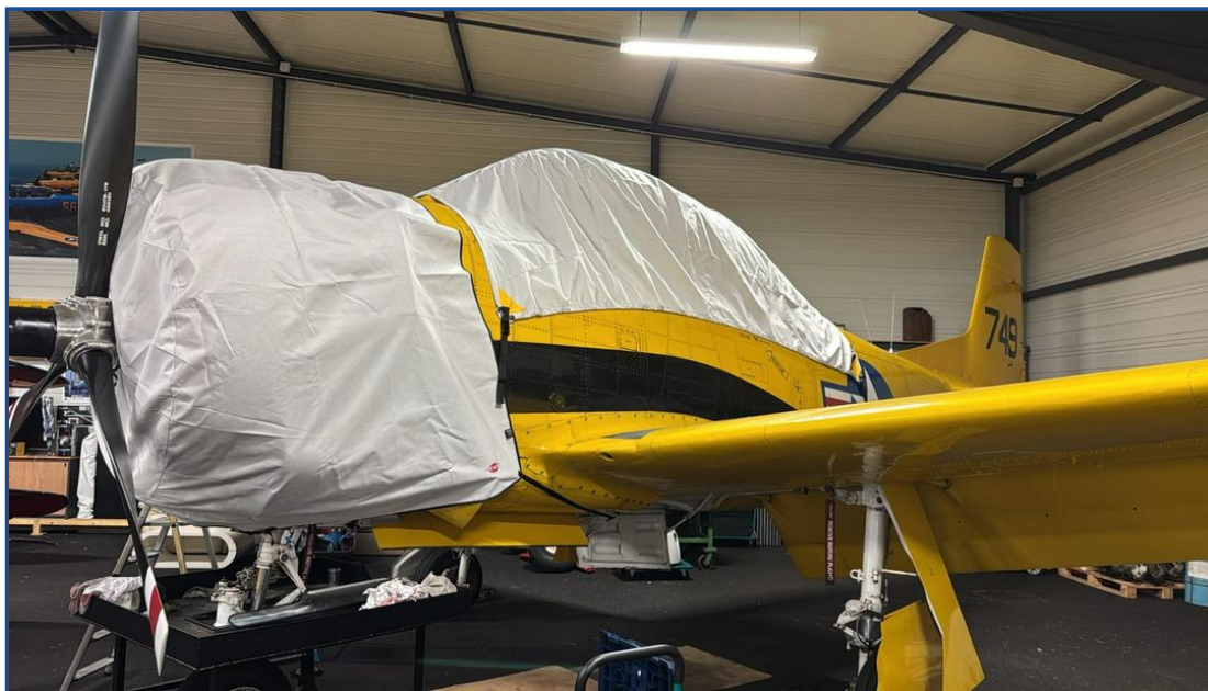
North American T28 Trojan Canopy and Engine Covers