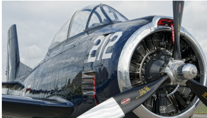
North American T28 Extended Canopy Cover T28 Trojan Carb. Air Inlet Plug