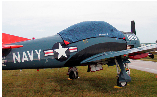
North American T28 Canopy Cover