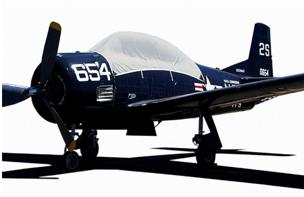
North American T28 Canopy Cover