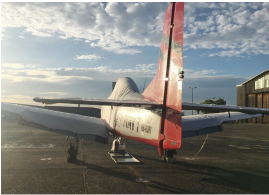
North American T28 Extended Canopy CoverT28 Engine Cover North American T28 Extended Canopy CoverT28 Wing Covers