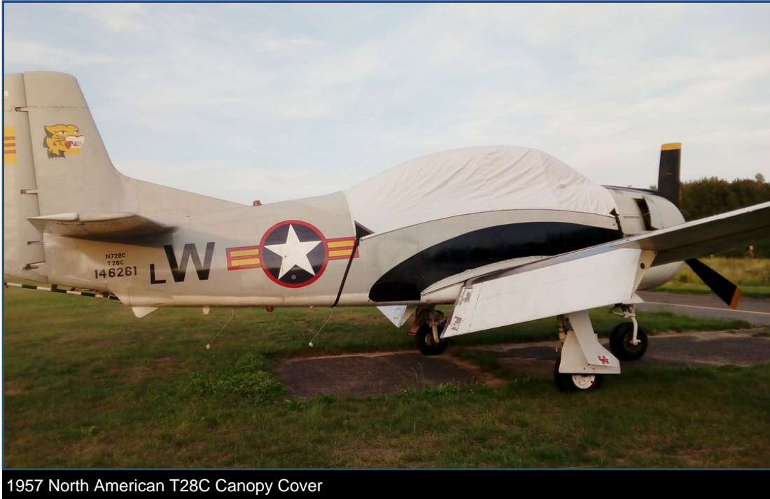
1957 North American T28C Canopy Cover