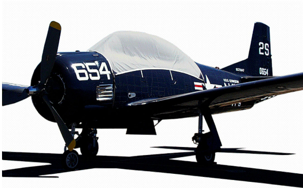
North American T28 Canopy Cover

Travel Covers are made with Silver Solution-Dyed Polyester fabric and only lined over the windshield to save weight. The material is lightweight and more compact for easy stowage in the aircraft. The polyester material is water resistant, but only intended for occasional use outside. We also have an ultra lightweight material available for fitted hangar dust covers. For daily outdoor use, the non-travel Sunbrella Cover is the best choice.