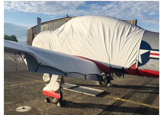
North American T28 Extended Canopy Cover