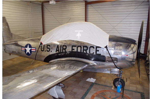
North American T-28 Canopy Cover