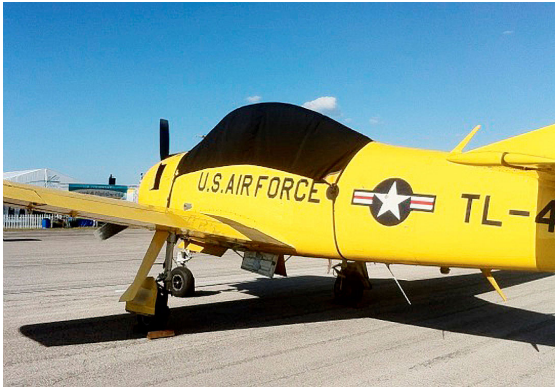
North American T28 Canopy Cover

This cover type is made from Silver Acrylic Sunbrella canvas and is 100% lined with a soft and smooth microfiber. Bruce's Custom Covers developed this material combination especially for aircraft protection. The outer material is medium weight and treated for water resistance, UV resistance and anti-static buildup. The inner lining is a very soft and smooth microfiber to prevent scratching. The material is very reflective, and tests show that the cabin interior temperature can be reduced to near-ambient temperature on the hottest of days. It is water, ice and snow repellent, yet breathable to allow moisture to escape from between the cover and the aircraft surface.