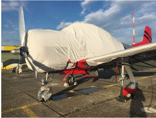
North American T28 Extended Canopy Cover T28 Engine Cover

This cover type is made from Silver Acrylic Sunbrella canvas and is 100% lined with a soft and smooth microfiber. Bruce's Custom Covers developed this material combination especially for aircraft protection. The outer material is medium weight and treated for water resistance, UV resistance and anti-static buildup. The inner lining is a very soft and smooth microfiber to prevent scratching. The material is very reflective, and tests show that the cabin interior temperature can be reduced to near-ambient temperature on the hottest of days. It is water, ice and snow repellent, yet breathable to allow moisture to escape from between the cover and the aircraft surface.