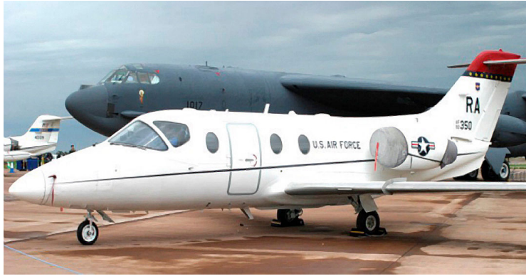
T-1A Jayhawk (Beechjet) Engine & Pitot Cover set