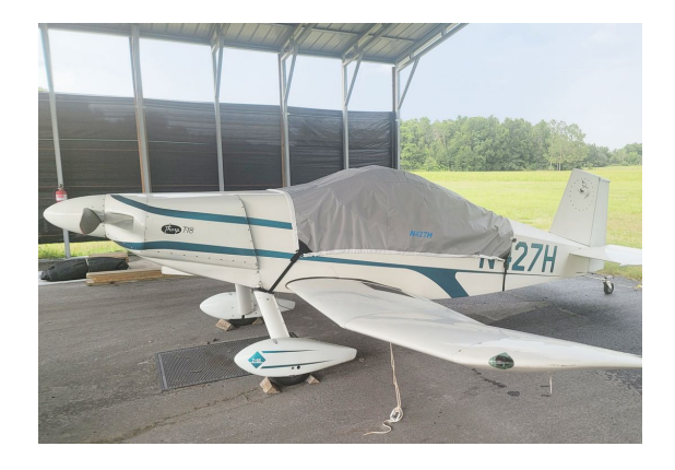
Thorp T-18 Travel Cover