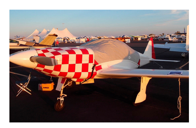
Thorp T-18 Canopy Cover

Travel Covers are made with Silver Solution-Dyed Polyester fabric and only lined over the windshield to save weight. The material is lightweight and more compact for easy stowage in the aircraft. The polyester material is water resistant, but only intended for occasional use outside. We also have an ultra lightweight material available for fitted hangar dust covers. For daily outdoor use, the non-travel Sunbrella Cover is the best choice.