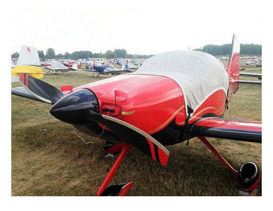
Van's RV-7 Canopy Cover & Engine Inlet Plugs