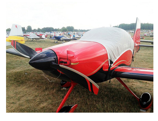
Van's RV-7 Canopy Cover & Engine Inlet Plugs