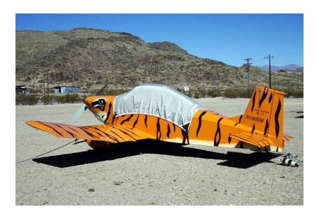
Thorp T-18 Canopy Cover

This cover type is made from Silver Acrylic Sunbrella canvas and is 100% lined with a soft and smooth microfiber. Bruce's Custom Covers developed this material combination especially for aircraft protection. The outer material is medium weight and treated for water resistance, UV resistance and anti-static buildup. The inner lining is a very soft and smooth microfiber to prevent scratching. The material is very reflective, and tests show that the cabin interior temperature can be reduced to near-ambient temperature on the hottest of days. It is water, ice and snow repellent, yet breathable to allow moisture to escape from between the cover and the aircraft surface.