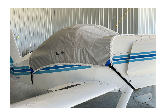
T-18 Travel Cover, Light Weight Canopy Cover (Bubble Canopy)

Travel Covers are made with Silver Solution-Dyed Polyester fabric and only lined over the windshield to save weight. The material is lightweight and more compact for easy stowage in the aircraft. The polyester material is water resistant, but only intended for occasional use outside. We also have an ultra lightweight material available for fitted hangar dust covers. For daily outdoor use, the non-travel Sunbrella Cover is the best choice.