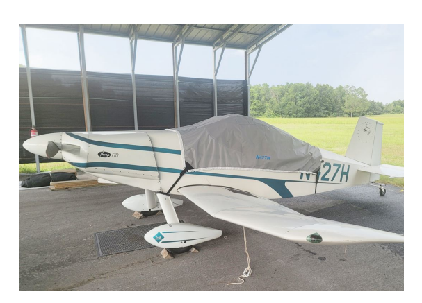
Thorp T-18 Travel Cover