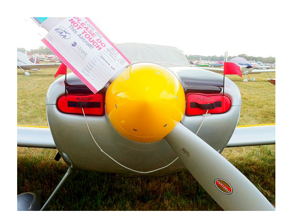
Vans's RV-7 Engine Engine Inlet Plugs