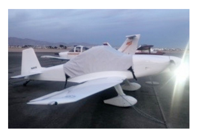
Thorp T-18 Canopy Cover