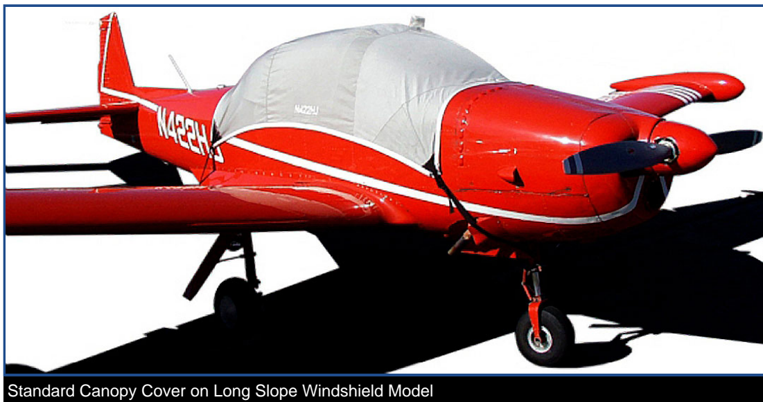
Standard Canopy Cover on Long Slope Windshield Model