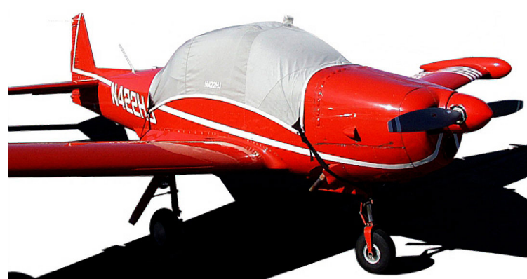
Standard Canopy Cover on Long Slope Windshield Model

This cover type is made from Silver Acrylic Sunbrella canvas and is 100% lined with a soft and smooth microfiber. Bruce's Custom Covers developed this material combination especially for aircraft protection. The outer material is medium weight and treated for water resistance, UV resistance and anti-static buildup. The inner lining is a very soft and smooth microfiber to prevent scratching. The material is very reflective, and tests show that the cabin interior temperature can be reduced to near-ambient temperature on the hottest of days. It is water, ice and snow repellent, yet breathable to allow moisture to escape from between the cover and the aircraft surface.