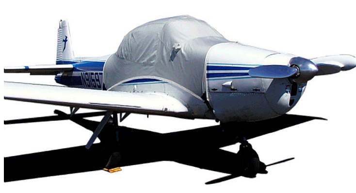
Navion Canopy Cover extends forward to firewall line.