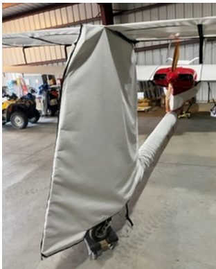
SZD-45 Ogar Empennage Cover

WINTER USE MATERIAL - Made with Solution-Dyed Polyester fabric, this option is intended for seasonal use to aid in deicing, rain mitigation, or for occasional travel. The material is lighter and more compact, but more susceptible to UV damage and may have a shorter useful life if used continuously outside than the all-year use material.