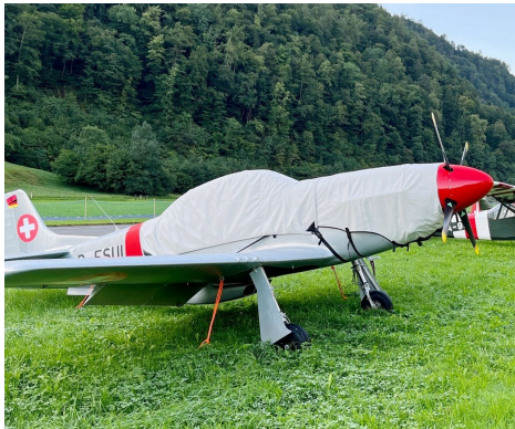
Stewart S-51 Canopy & Engine Covers

Covers developed this material combination especially for aircraft protection. The outer material is medium weight and treated for water resistance, UV resistance and anti-static buildup. The inner lining is a very soft and smooth microfiber to prevent scratching. The material is very reflective, and tests show that the cabin interior temperature can be reduced to near-ambient temperature on the hottest of days. It is water, ice and snow repellent, yet breathable to allow moisture to escape from between the cover and the aircraft surface.