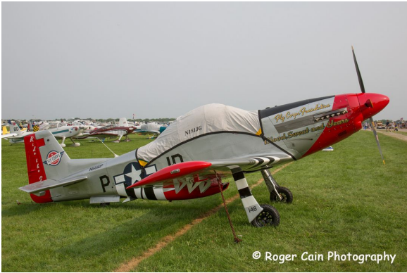
Titan Mustang Canopy Cover

the hottest of days. It is water, ice and snow repellent, yet breathable to allow moisture to escape from between the cover and the aircraft surface.