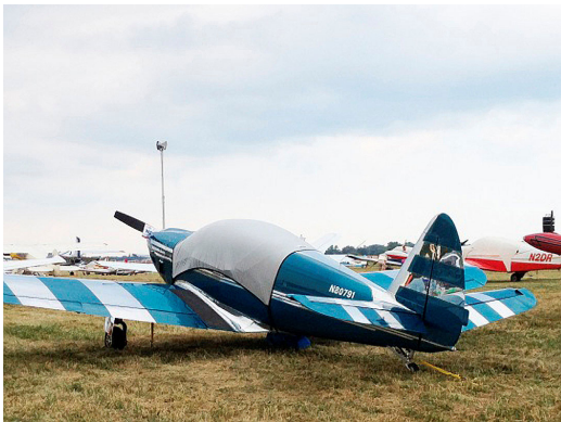
Swift Light Weight Canopy Cover

This cover type is made from Silver Acrylic Sunbrella canvas and is 100% lined with a soft and smooth microfiber. Bruce's Custom Covers developed this material combination especially for aircraft protection. The outer material is medium weight and treated for water resistance, UV resistance and anti-static buildup. The inner lining is a very soft and smooth microfiber to prevent scratching. The material is very reflective, and tests show that the cabin interior temperature can be reduced to near-ambient temperature on the hottest of days. It is water, ice and snow repellent, yet breathable to allow moisture to escape from between the cover and the aircraft surface.