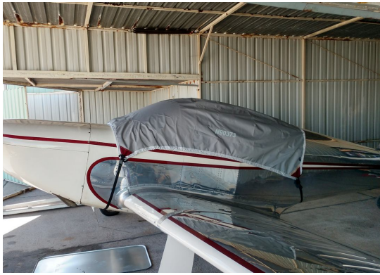
Globe GC-1B Lightweight Travel Cover