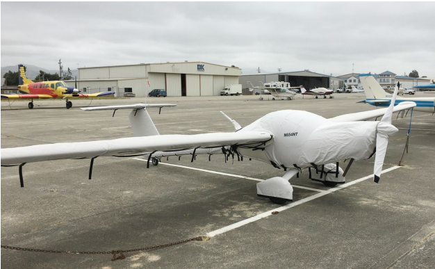
Distar Sundancer LSA Extended Canopy/Engine, Prop, Wheelpants, Wings & Empennage Covers