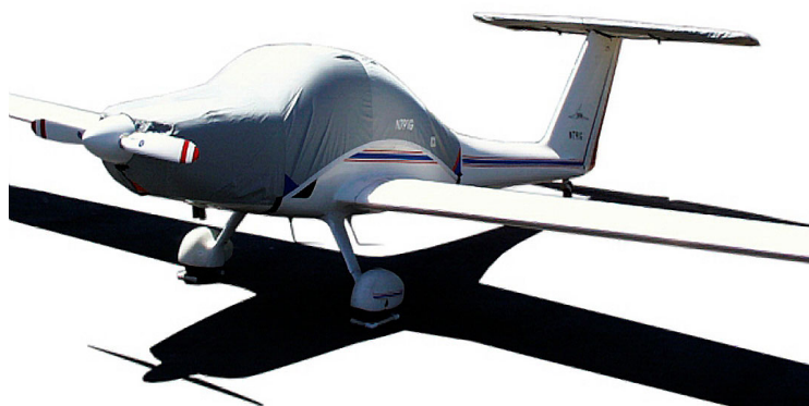
Grob 109 Canopy/Engine Cover & Horiz. Stabilizer Cover