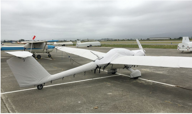
Distar Sundancer LSA Extended Canopy/Engine, Prop, Wheelpants, Wings & Empennage Covers