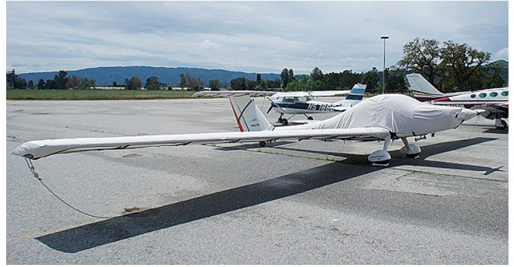
Grob 109 Canopy/Engine w/ extension to tail, Wing, Stabilizer & Prop/Spinner Covers