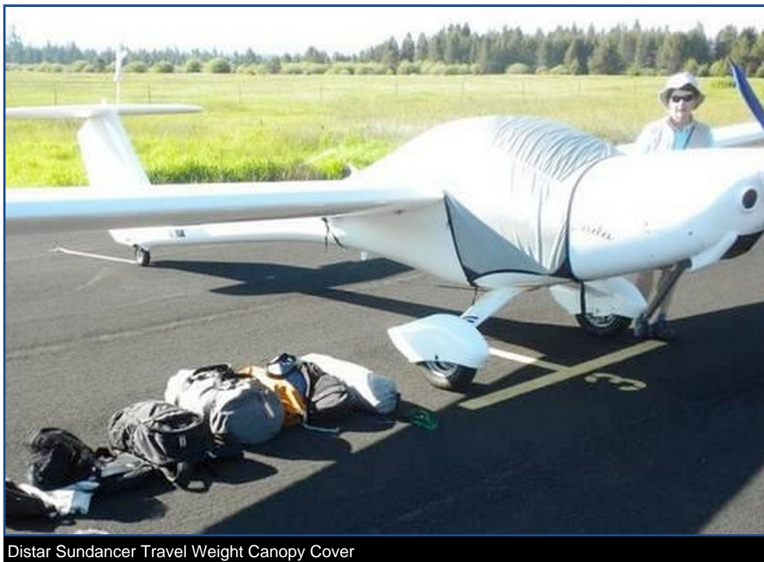
Distar Sundancer Travel Weight Canopy Cover