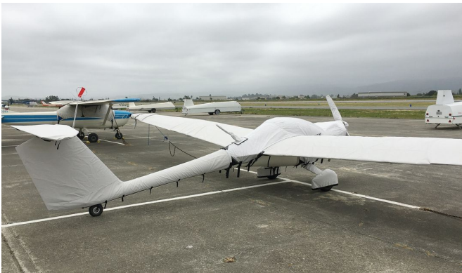
Distar Sundancer LSA Extended Canopy/Engine, Prop, Wheelpants, Wings & Empennage Covers