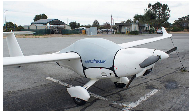
Lambda Travel Canopy Cover