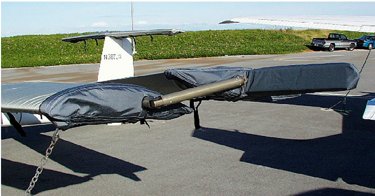
DG-505 Canopy/Nose, Wing, Empennage & Horiz. Stab. Covers End Cap Covers are used when wing are in folded position.