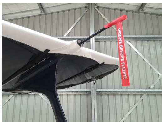
Beech Staggerwing Complete Cover Set, Upper Wing Detail

Engine Inlet Plugs are custom fit for your Beech Staggerwing intakes, made with heavy-duty vinyl material, and stuffed with a single block of sculpted urethane foam. Each plug has a zipper that allows the foam to be removed and dried if necessary. Engine plugs have warning flags that are visible from the cockpit or 'remove before flight' streamers sewn onto the face of the plugs. Most plugs are imprinted with the aircraft registration number in black for an extra charge. Storage bag NOT included. Engine plugs may be inserted after flight when the engine is still warm. Engine Inlet Plugs are commonly referred to as Cowl Plugs, Intake Plugs, Cowl Blocks, Engine Blocks, and Engine Bungs.