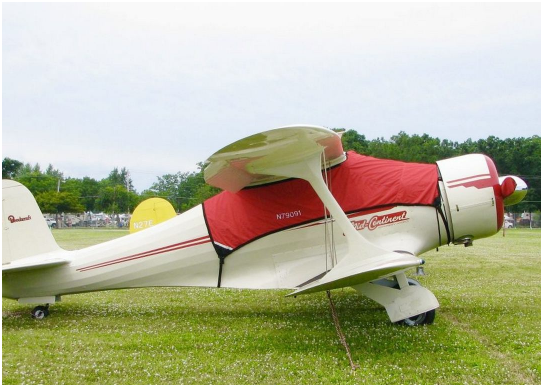
Beech Staggerwing Canopy Cover

This cover type is made from Silver Acrylic Sunbrella canvas and is 100% lined with a soft and smooth microfiber. Bruce's Custom Covers developed this material combination especially for aircraft protection. The outer material is medium weight and treated for water resistance, UV resistance and anti-static buildup. The inner lining is a very soft and smooth microfiber to prevent scratching. The material is very reflective, white cover, and tests show that the cabin interior temperature can be reduced to near-ambient temperature on the hottest of days. It is water, ice and snow repellent, yet breathable to allow moisture to escape from between the cover and the aircraft surface.