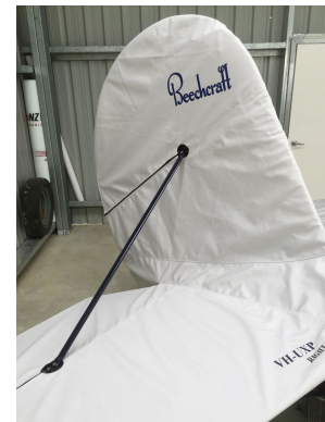
Waco UPF-7 Upper Wing Cover, Horizontal Stabilizer Cover & Canopy Cover Beech Staggerwing Complete Cover Set, Tail Detail