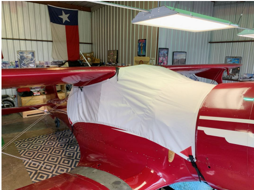
Beech Staggerwing D17S Canopy Cover