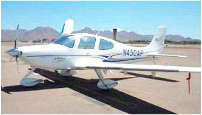
Cirrus SR20 HeatShield set