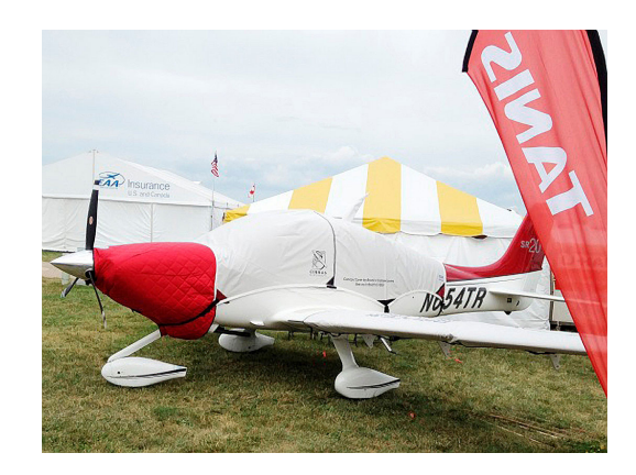
Cirrus SR22 Canopy Cover / Insulated Engine Cover / Wing Covers