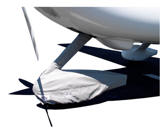
Cirrus SR-22 Wheelpant Cover