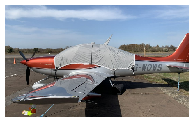
Cirrus SR-22 Travel Weight Canopy Cover