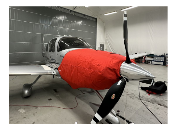
Cirrus SR-22 Insulated Engine Cover

This cover type is made from Silver Acrylic Sunbrella canvas and is 100% lined with a soft and smooth microfiber. Bruce's Custom Covers developed this material combination especially for aircraft protection. The outer material is medium weight and treated for water resistance, UV resistance and anti-static buildup. The inner lining is a very soft and smooth microfiber to prevent scratching. The material is very reflective, and tests show that the cabin interior temperature can be reduced to near-ambient temperature on the hottest of days. It is water, ice and snow repellent, yet breathable to allow moisture to escape from between the cover and the aircraft surface.