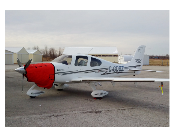
Cirrus SR22 Insulated Engine Cover