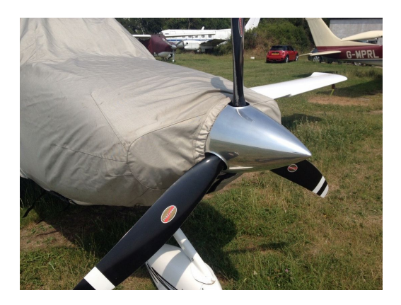
Cirrus SR-20 GTS Extended Canopy/Engine Cover