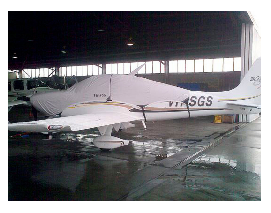
Cirrus SR22 Canopy/Engine Cover

Travel Covers are made with Silver Solution-Dyed Polyester fabric and only lined over the windshield to save weight. The material is lightweight and more compact for easy stowage in the aircraft. The polyester material is water resistant, but only intended for occasional use outside. We also have an ultra lightweight material available for fitted hangar dust covers. For daily outdoor use, the non-travel Sunbrella Cover is the best choice.