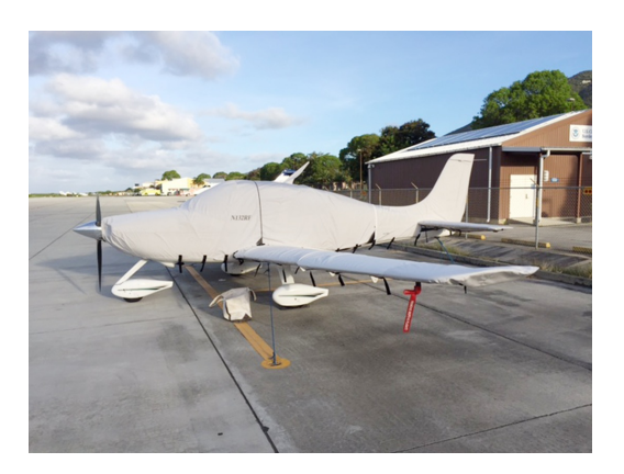
Cirrus SR-22 Full Cover Set

WINTER USE MATERIAL - Made with Solution-Dyed Polyester fabric, this option is intended for seasonal use to aid in deicing, rain mitigation, or for occasional travel. The material is lighter and more compact, but more susceptible to UV damage and may have a shorter useful life if used continuously outside than the all-year use material.