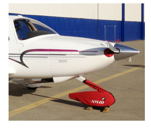
Cirrus SR-22 Wheelpant Covers