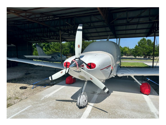
Cirrus SR-22 Wheelpant Covers