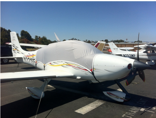
Cirrus Light Weight Travel Canopy Cover