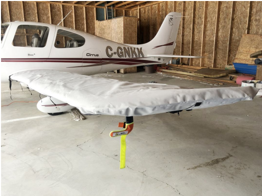
Cirrus SR20 Wing Covers Winter Use with Imprint

WINTER USE MATERIAL - Made with Solution-Dyed Polyester fabric, this option is intended for seasonal use to aid in deicing, rain mitigation, or for occasional travel. The material is lighter and more compact, but more susceptible to UV damage and may have a shorter useful life if used continuously outside than the all-year use material.