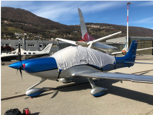
Cirrus SR-22 Canopy Cover (extends to cover parachute panel), Engine Plugs

Engine Inlet Plugs are custom fit for your Cirrus SR22 intakes, made with heavy-duty vinyl material, and stuffed with a single block of sculpted urethane foam. Each plug has a zipper that allows the foam to be removed and dried if necessary. Engine plugs have warning flags that are visible from the cockpit or 'remove before flight' streamers sewn onto the face of the plugs. Most plugs are imprinted with the aircraft registration number in black for an extra charge. Storage bag NOT included. Engine plugs may be inserted after flight when the engine is still warm. Engine Inlet Plugs are commonly referred to as Cowl Plugs, Intake Plugs, Cowl Blocks, Engine Blocks, and Engine Bungs.