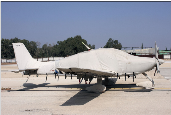
Cirrus SR-22 Full Cover Set