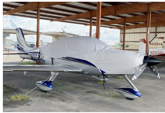
Cirrus SR22 Canopy/Engine Cover