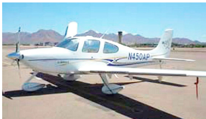
Cirrus SR20 HeatShield set