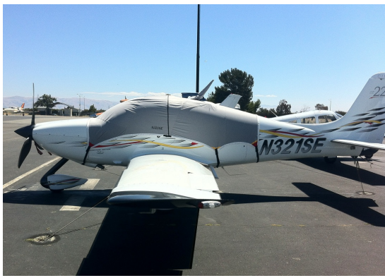
Cirrus SR-22 Light Weight Travel Cover