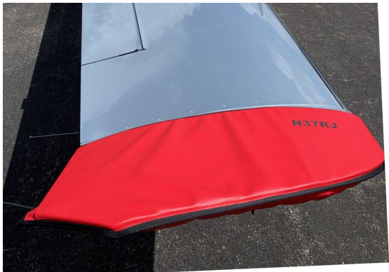
Cirrus SR-22 Wingtip Pads

Designed to prevent damage to the aircraft extremities in crowded hangars, these products are made of bright red Naugahyde and thickly padded with a sandwich of closed cell foam.