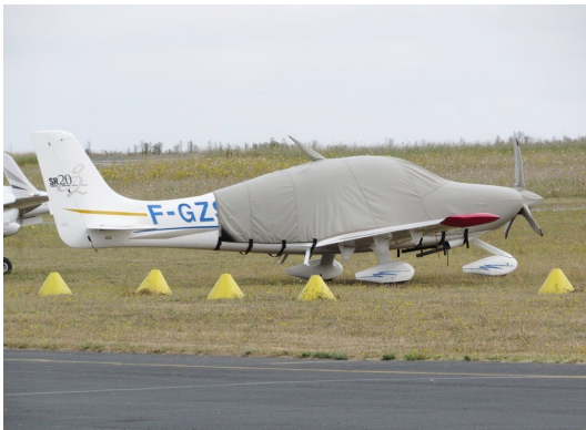
Cirrus SR-22 Extended Canopy/Engine Cover, Prop Cover, Wingtip Pads

This cover type is made from Silver Acrylic Sunbrella canvas and is 100% lined with a soft and smooth microfiber. Bruce's Custom Covers developed this material combination especially for aircraft protection. The outer material is medium weight and treated for water resistance, UV resistance and anti-static buildup. The inner lining is a very soft and smooth microfiber to prevent scratching. The material is very reflective, and tests show that the cabin interior temperature can be reduced to near-ambient temperature on the hottest of days. It is water, ice and snow repellent, yet breathable to allow moisture to escape from between the cover and the aircraft surface.