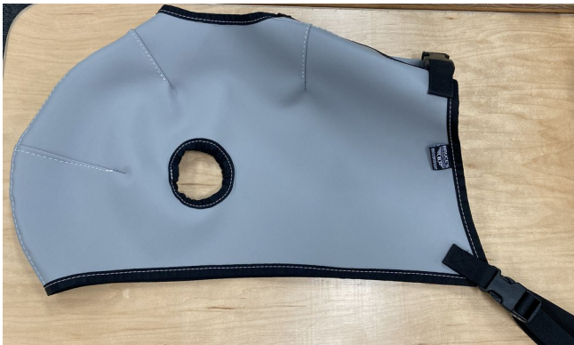
Cirrus SR-22 Wheelpant Cover