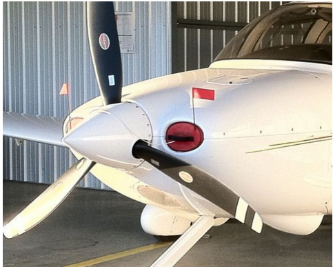
Cirrus SR-22 Engine Inlet Plugs