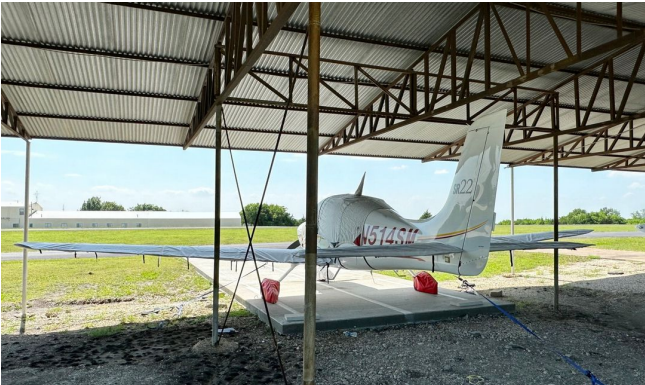
Cirrus SR-22 Canopy, Wing & Wheelpan Covers