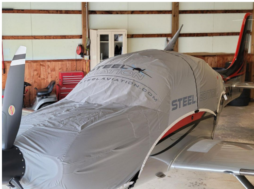
Cirrus SR22 Travel Cover, Light Weight Travel Canopy/Engine Cover with Custom Artwork

Travel Covers are made with Silver Solution-Dyed Polyester fabric and only lined over the windshield to save weight. The material is lightweight and more compact for easy stowage in the aircraft. The polyester material is water resistant, but only intended for occasional use outside. We also have an ultra lightweight material available for fitted hangar dust covers. For daily outdoor use, the non-travel Sunbrella Cover is the best choice.