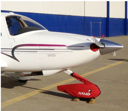
Cirrus SR20 Front Wheelpant/Strut Cover, Engine Plugs

protection and cover longevity. This heavier more durable material is intended for all weather conditions, such as rain and snow or lots of sun.