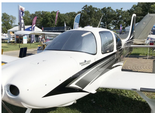
Cirrus SR-22 Cockpit HeatShields

Windshield Heatshields are interior sunshades for an aircraft's front windshield. The product is a unique composite of closed-cell foam with a silver mylar finish. The semi-rigid design is stiff enough to stand along the inside of the windshield using sun visors or window framing. It folds up flat and easily stores in the included storage sleeve. Some designs may require velcro and suction cups or split right and left sides. A Heatshield is an excellent short-term remedy for cockpit overheating. An external fabric cover is far more effective and practical for long-term protection.