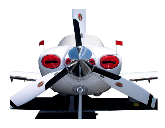
Cirrus SR22 Engine Plugs