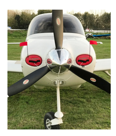
Cirrus SR20 G2 GTS Engine Inlet Plugs