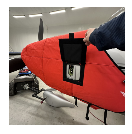
Cirrus SR-22 Insulated Engine Cover