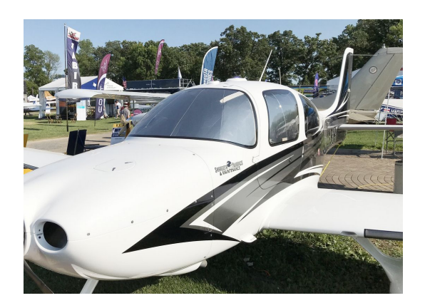
Cirrus SR-22 Cockpit HeatShields