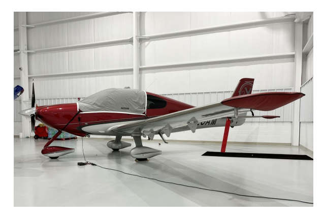
Cirrus SR-22 Cockpit Cover