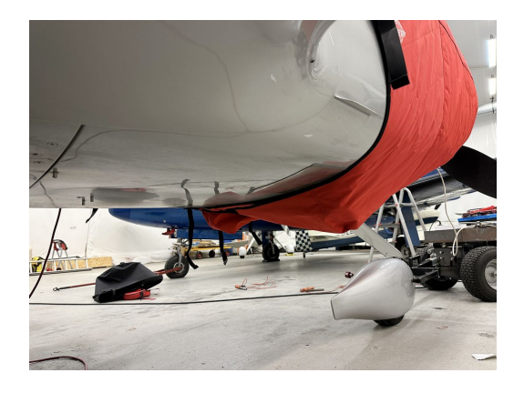
Cirrus SR-22 Insulated Engine Cover