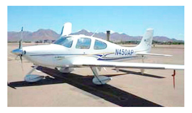
Cirrus SR20 HeatShield set

Windshield Heatshields are interior sunshades for an aircraft's front windshield. The product is a unique composite of closed-cell foam with a silver mylar finish. The semi-rigid design is stiff enough to stand along the inside of the windshield using sun visors or window framing. It folds up flat and easily stores in the included storage sleeve. Some designs may require velcro and suction cups or split right and left sides. A Heatshield is an excellent short-term remedy for cockpit overheating. An external fabric cover is far more effective and practical for long-term protection.