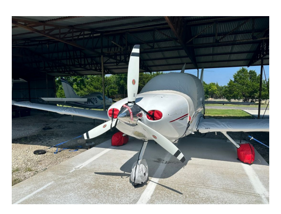
Cirrus SR-22 Wheelpant Covers