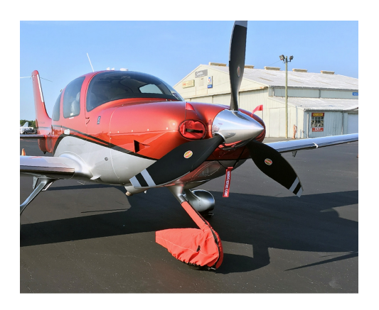
Cirrus SR22 Front Wheelpant/Strut Cover