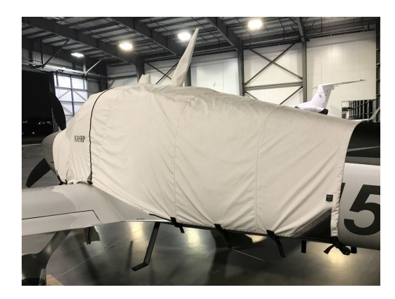
Cirrus SR-22T Extended Canopy/Engine Cover

This cover type is made from Silver Acrylic Sunbrella canvas and is 100% lined with a soft and smooth microfiber. Bruce's Custom Covers developed this material combination especially for aircraft protection. The outer material is medium weight and treated for water resistance, UV resistance and anti-static buildup. The inner lining is a very soft and smooth microfiber to prevent scratching. The material is very reflective, and tests show that the cabin interior temperature can be reduced to near-ambient temperature on the hottest of days. It is water, ice and snow repellent, yet breathable to allow moisture to escape from between the cover and the aircraft surface.