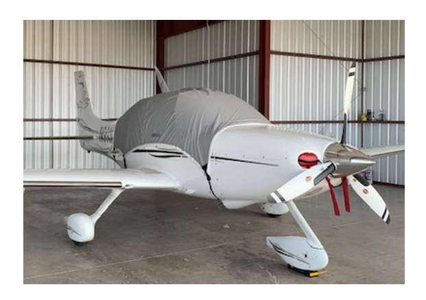
Cirrus SR-22 Travel Weight Canopy Cover