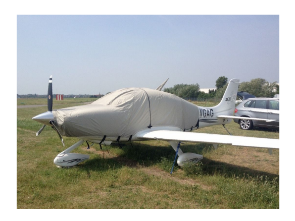
Cirrus SR-20 GTS Extended Canopy/Engine Cover