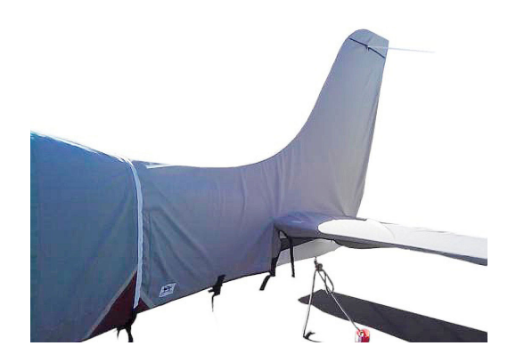
Cirrus SR-22 Full Cover Set