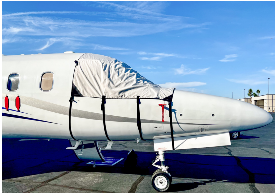
IAI Astron SPX Cockpit Cover