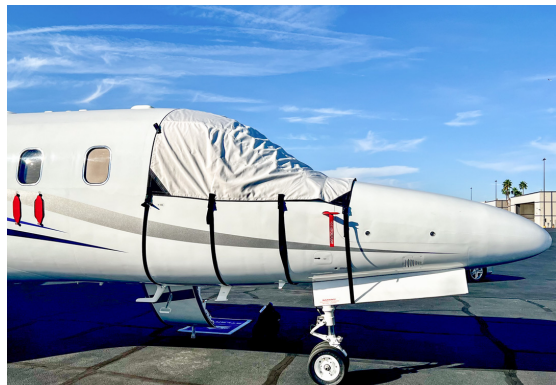
IAI Astra SPX Cockpit Cover

This cover type is made from Silver Acrylic Sunbrella canvas and is 100% lined with a soft and smooth microfiber. Bruce's Custom Covers developed this material combination especially for aircraft protection. The outer material is medium weight and treated for water resistance, UV resistance and anti-static buildup. The inner lining is a very soft and smooth microfiber to prevent scratching. The material is very reflective, and tests show that the cabin interior temperature can be reduced to near-ambient temperature on the hottest of days. It is water, ice and snow repellent, yet breathable to allow moisture to escape from between the cover and the aircraft surface.