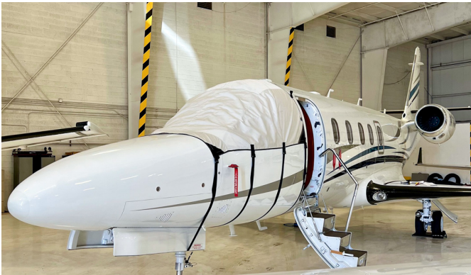
Astron SPX Cockpit Cover

This cover type is made from Silver Acrylic Sunbrella canvas and is 100% lined with a soft and smooth microfiber. Bruce's Custom Covers developed this material combination especially for aircraft protection. The outer material is medium weight and treated for water resistance, UV resistance and anti-static buildup. The inner lining is a very soft and smooth microfiber to prevent scratching. The material is very reflective, and tests show that the cabin interior temperature can be reduced to near-ambient temperature on the hottest of days. It is water, ice and snow repellent, yet breathable to allow moisture to escape from between the cover and the aircraft surface.