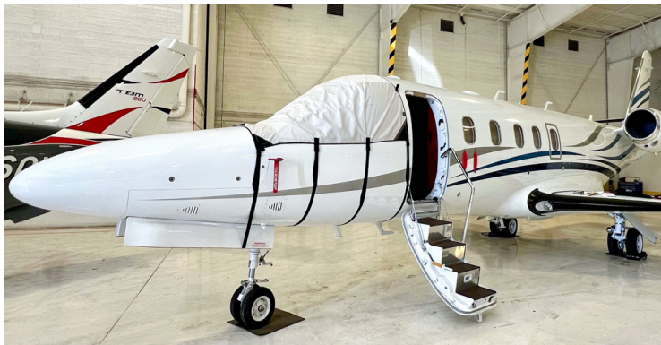
Astra SPX Cockpit Cover