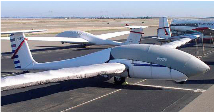
Grob 103 Canopy/Nose & Wing Covers