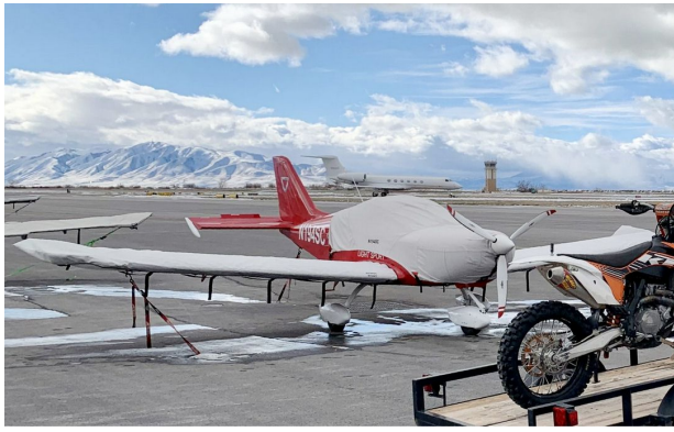
Czech Aircraft SportCruiser Canopy/Engine & Wing Covers