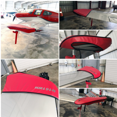
Cirrus SR22 Wingtip Pads, G5 Models

Designed to prevent damage to the aircraft extremities in crowded hangars, these products are made of bright red Naugahyde and thickly padded with a sandwich of closed cell foam.