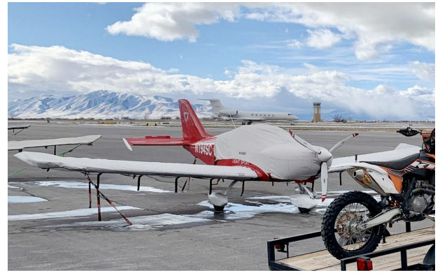
Czech Aircraft SportCruiser Canopy/Engine & Wing Covers