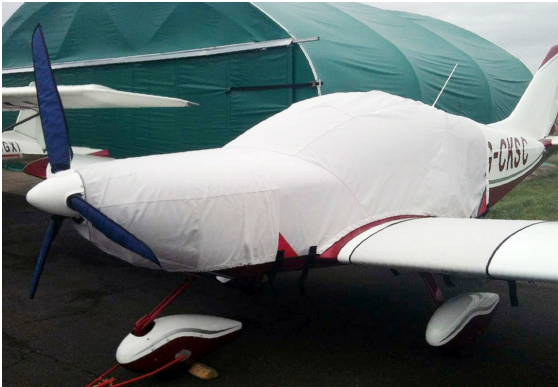
Czech Aircraft Works SportCruiser Canopy/Engine Cover