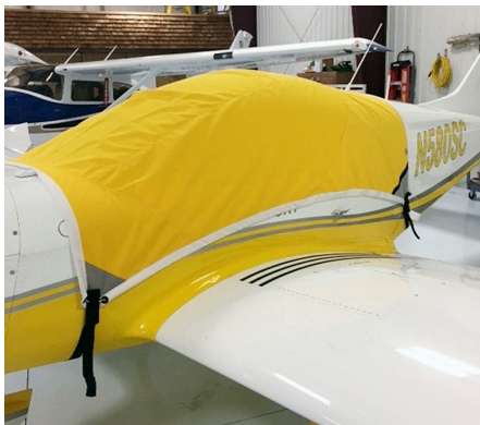
Custom Yellow Canopy Cover

This cover type is made from Silver Acrylic Sunbrella canvas and is 100% lined with a soft and smooth microfiber. Bruce's Custom Covers developed this material combination especially for aircraft protection. The outer material is medium weight and treated for water resistance, UV resistance and anti-static buildup. The inner lining is a very soft and smooth microfiber to prevent scratching. The material is very reflective, and tests show that the cabin interior temperature can be reduced to near-ambient temperature on the hottest of days. It is water, ice and snow repellent, yet breathable to allow moisture to escape from between the cover and the aircraft surface.