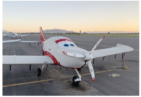
SportCruiser Canopy/Engine & Wing Covers