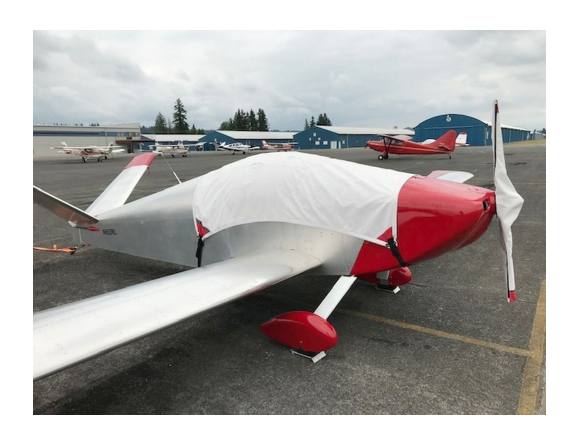
Sonex Xenos Canopy & Prop Cover

This cover type is made from Silver Acrylic Sunbrella canvas and is 100% lined with a soft and smooth microfiber. Bruce's Custom Covers developed this material combination especially for aircraft protection. The outer material is medium weight and treated for water resistance, UV resistance and anti-static buildup. The inner lining is a very soft and smooth microfiber to prevent scratching. The material is very reflective, and tests show that the cabin interior temperature can be reduced to near-ambient temperature on the hottest of days. It is water, ice and snow repellent, yet breathable to allow moisture to escape from between the cover and the aircraft surface.