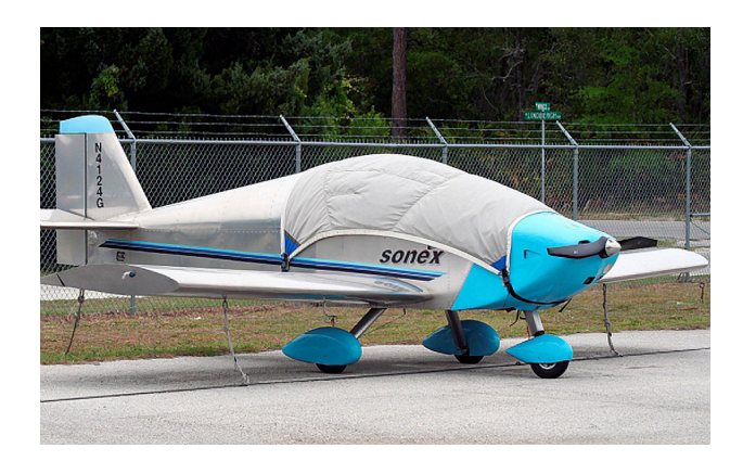
Sonex Canopy Cover

This cover type is made from Silver Acrylic Sunbrella canvas and is 100% lined with a soft and smooth microfiber. Bruce's Custom Covers developed this material combination especially for aircraft protection. The outer material is medium weight and treated for water resistance, UV resistance and anti-static buildup. The inner lining is a very soft and smooth microfiber to prevent scratching. The material is very reflective, and tests show that the cabin interior temperature can be reduced to near-ambient temperature on the hottest of days. It is water, ice and snow repellent, yet breathable to allow moisture to escape from between the cover and the aircraft surface.