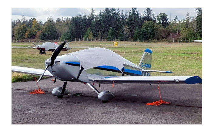
Sonex Canopy Cover