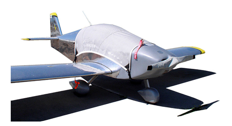
Sonex Canopy Cover