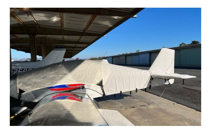
Sonex Empennage Cover, & Canopy Cover

WINTER USE MATERIAL - Made with Solution-Dyed Polyester fabric, this option is intended for seasonal use to aid in deicing, rain mitigation, or for occasional travel. The material is lighter and more compact, but more susceptible to UV damage and may have a shorter useful life if used continuously outside than the all-year use material.