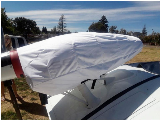
Seamax M22 Engine Cover, test fit cover

Engine Covers will cinch around or behind the spinner, cover the entire engine cowl area including the engine air cooling and induction air inlets, and fastens together with Velcro beneath the spinner down the front of the cowling. The Engine Cover is attached with a belly strap aft of the firewall, and can Velcro to the Canopy Cover. Engine Covers are normally made from Solution-Dyed Polyester or Acrylic Sunbrella . An Insulated version of the engine cover can be made with a thicker, quilted, and water-repellent material. The Insulated Engine Cover works well in cold climates to help with engine preheating.