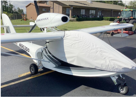
Seamax Canopy/Nose Cover

The material is very reflective, and tests show that the cabin interior temperature can be reduced to near-ambient temperature on the hottest of days. It is water, ice and snow repellent, yet breathable to allow moisture to escape from between the cover and the aircraft surface.