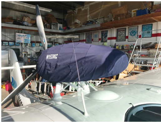
Seamax M22 Engine Cover