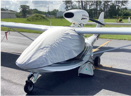
Seamax Canopy/Nose Cover