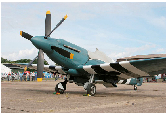
Supermarine Spitfire XIX Canopy Cover