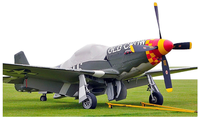
Canopy Cover, Chin Scoop & Exhaust Plugs