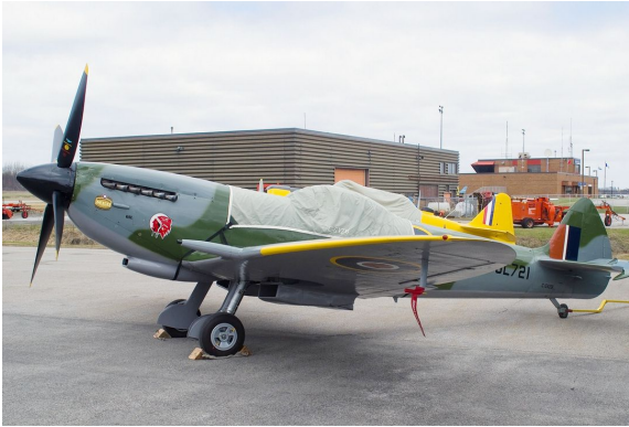
Supermarine Spitfire Mk 14 Canopy Cover

Travel Covers are made with Silver Solution-Dyed Polyester fabric and only lined over the windshield to save weight. The material is lightweight and more compact for easy stowage in the aircraft. The polyester material is water resistant, but only intended for occasional use outside. We also have an ultra lightweight material available for fitted hangar dust covers. For daily outdoor use, the non-travel Sunbrella Cover is the best choice.