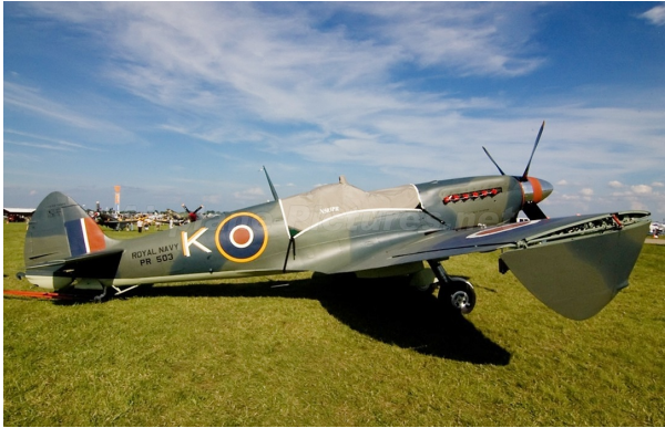
Supermarine Spitfire Mk IX Canopy Cover