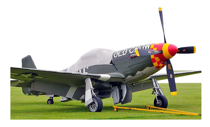
Canopy Cover, Chin Scoop & Exhaust Plugs