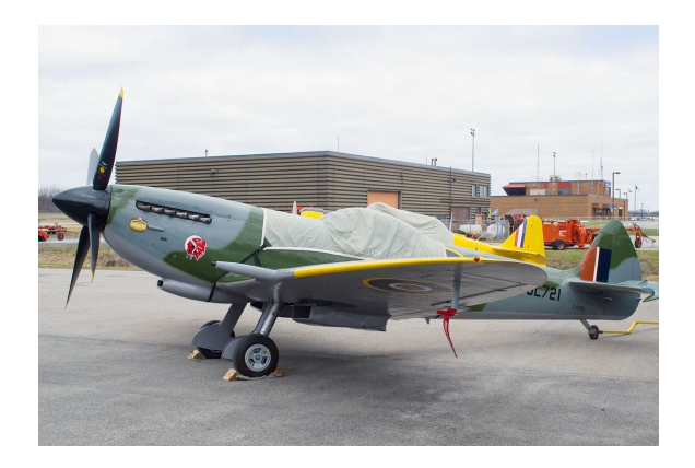
Supermarine Spitfire Mk 14 Canopy Cover

Travel Covers are made with Silver Solution-Dyed Polyester fabric and only lined over the windshield to save weight. The material is lightweight and more compact for easy stowage in the aircraft. The polyester material is water resistant, but only intended for occasional use outside. We also have an ultra lightweight material available for fitted hangar dust covers. For daily outdoor use, the non-travel Sunbrella Cover is the best choice.