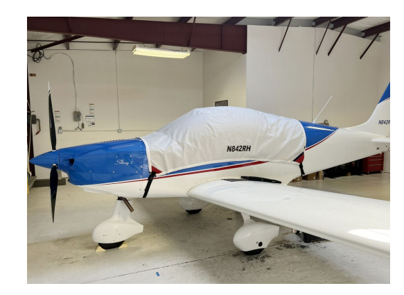
Airplane Factory Sling 2 Canopy Cover