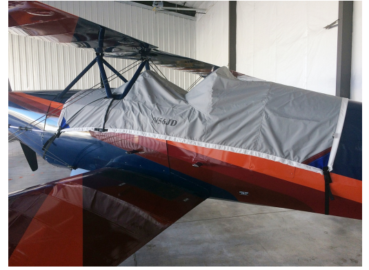
Steen Skybolt Travel Cover