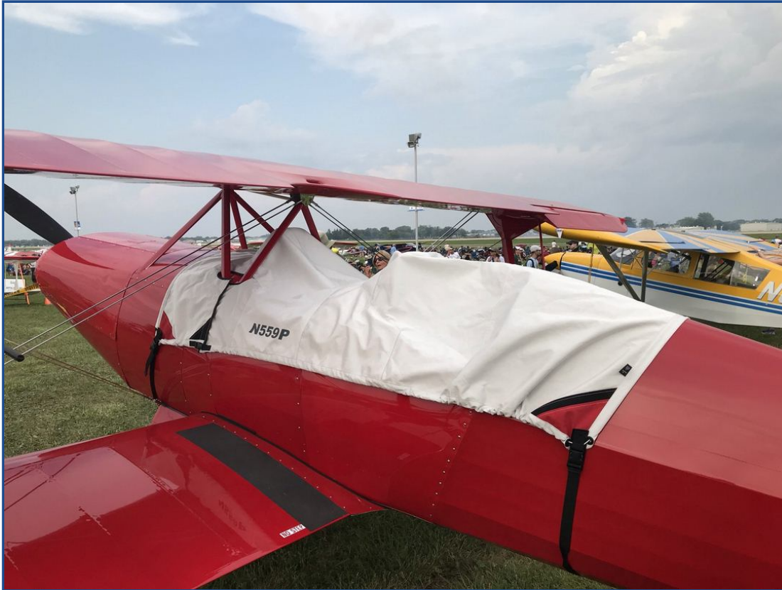
Steen Skybolt Canopy Cover