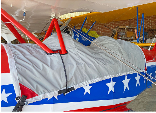
Steen Skybolt Travel Cover, Light Weight Canopy Cover (Specify Open Or Enclosed Cockpit)