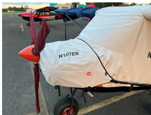
Best Off Skyranger Canopy Cover, Engine Cover