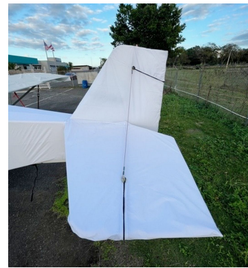
Best Off Skyranger Empennage Cover, test fit cover