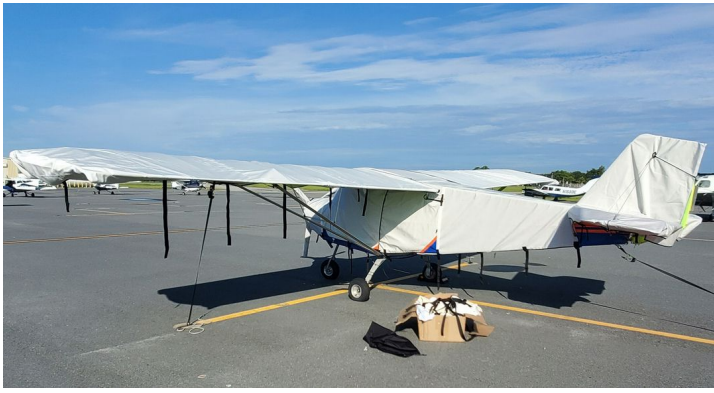
Best Off Skyranger Complete Cover Set