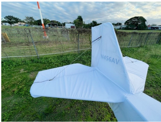
Best Off Skyranger Empennage Cover, test fit cover

WINTER USE MATERIAL - Made with Solution-Dyed Polyester fabric, this option is intended for seasonal use to aid in deicing, rain mitigation, or for occasional travel. The material is lighter and more compact, but more susceptible to UV damage and may have a shorter useful life if used continuously outside than the all-year use material.