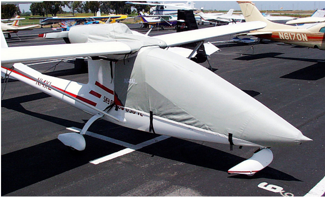
Sky Arrow Canopy & Engine Covers

This cover type is made from Silver Acrylic Sunbrella canvas and is 100% lined with a soft and smooth microfiber. Bruce's Custom Covers developed this material combination especially for aircraft protection. The outer material is medium weight and treated for water resistance, UV resistance and anti-static buildup. The inner lining is a very soft and smooth microfiber to prevent scratching. The material is very reflective, and tests show that the cabin interior temperature can be reduced to near-ambient temperature on the hottest of days. It is water, ice and snow repellent, yet breathable to allow moisture to escape from between the cover and the aircraft surface.