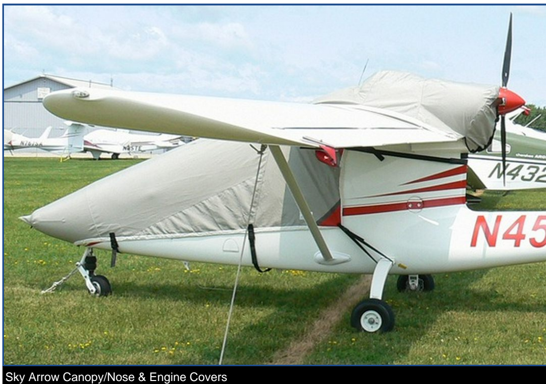
Sky Arrow Canopy/Nose &amp; Engine Covers

(iniziative-industriali-magnaghi-aeronautica-spa-SKA.pdf)