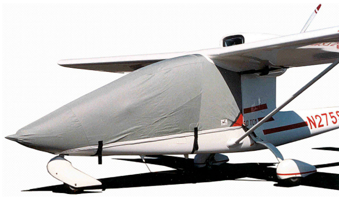
Sky Arrow Standard Canopy Cover