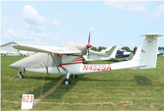
Sky Arrow Canopy & Engine Covers