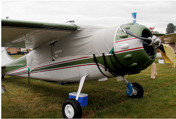
Cessna 195 Canopy Cover, extended forward and over gas caps Cessna 195 Canopy Cover, extended forward and over gas caps